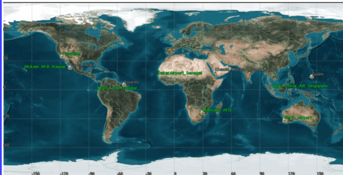
Figure 42 shows 11 potential basing locations. A survey of satellite photos for the various locations allowed verification that these sites have ample space for any required infrastructure improvement to accommodate a large geoengineering fleet.

“This study focuses on airplane and airship operations to the stratosphere to release a geoengineering payload with the goal of reducing incoming solar flux. Airships are also considered for this mission. To provide a comparison to conventional aircraft operations, more exotic concepts such as rockets, guns, and suspended pipes are also examined....For maximum cooling impact, the particulate payloads are best placed near the equator. This study assumes that the payload is released within latitudes 30°N and 30°S, though North-South basing location had minimal effect on cost. Transit operations, flying East- West between equally spaced bases around the equator, were examined as a method to ensure adequate dispersal of the payload around the equator. Global winds aid in East-West dispersal so a smaller number of bases and shorter range systems (referred to as Regional operations) can be employed with minimal impact on dispersal. Regional operations allow the dispersal leg length to be dictated by the desired release rate of 0.03kg/m flown. This means the airplanes fly no further than they have to, on the order of 300-800 km, and fuel costs are minimized.” – Aurora Flight Sciences: Geoengineering Final report Yearly cost estimates from different dispersal methods ranged from over 1 billion dollars a year all the way up to rocket dispersed aerosol in the upper atmosphere at the cost of over 100 billion dollars per year.