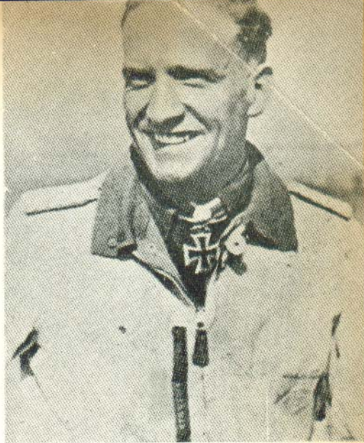
Hans Ulrich Rudel

A German dive bomber (Type JU 87) in the air.