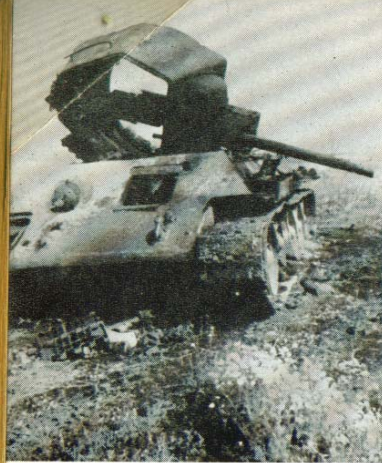
"A perfectly exploded Russian tank (T 34) after direct hit by a Stuka."