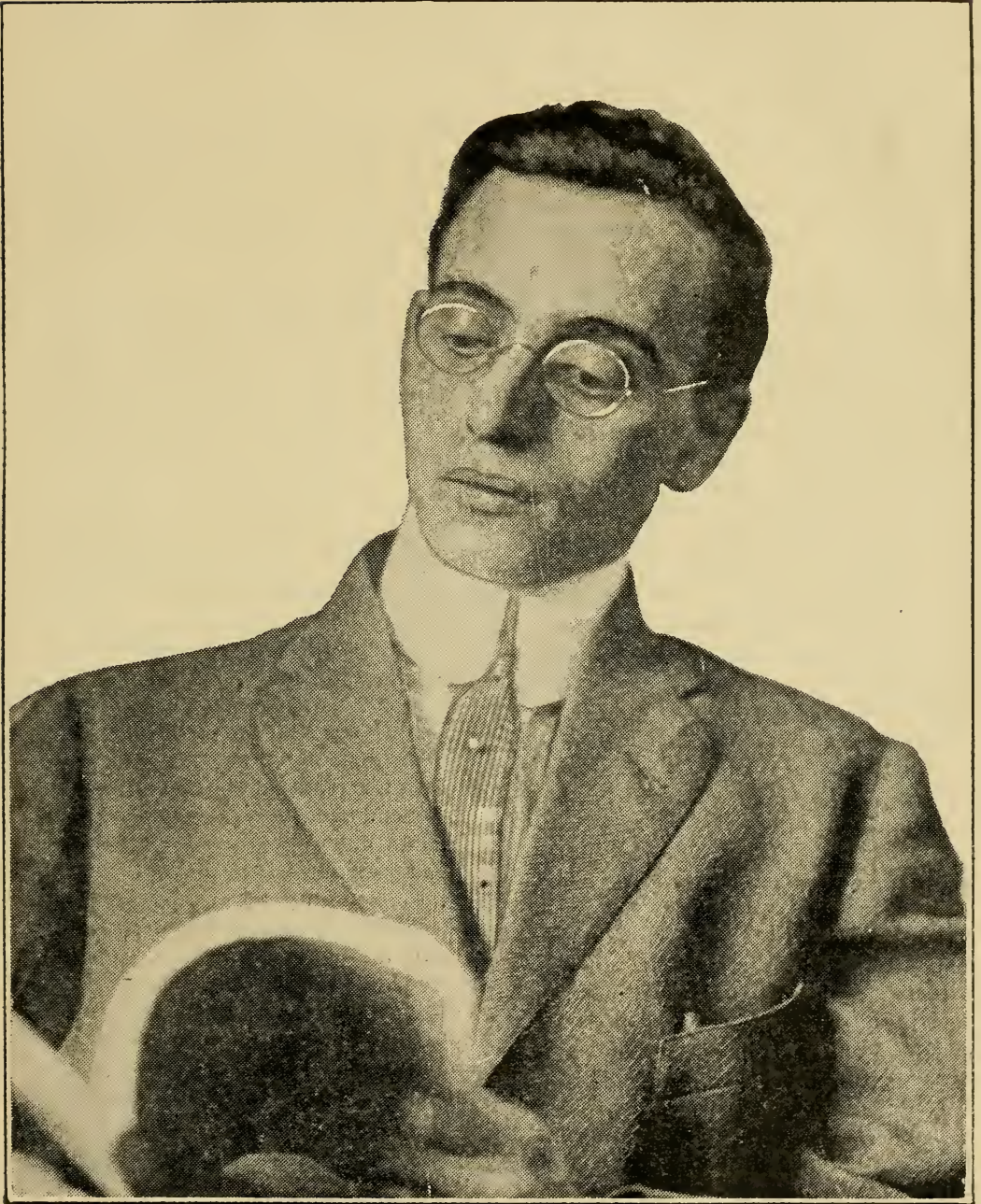
LEO FRANK. STUDY THE MOUTH, NOSE, AND AVERTED EYES