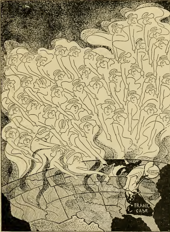
"SHAMING" THE STATE OF GEORGIA IN THE STRAUSS PUCK MAGAZINE.

Georgia as a masked ruffian, with a coil of rope in his hand, trying to seize Leo Frank, and lynch him, without a legal trial. The witnesses to the scene are Uncle Sam, and a touring-car full of the other States in the Union! A