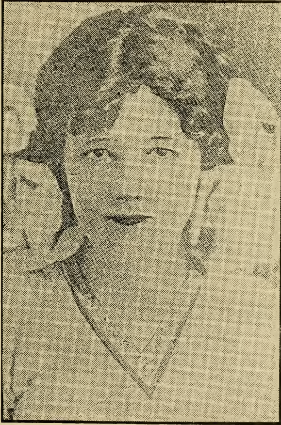
LEO FRANK'S VICTIM, MARY PHAGAN