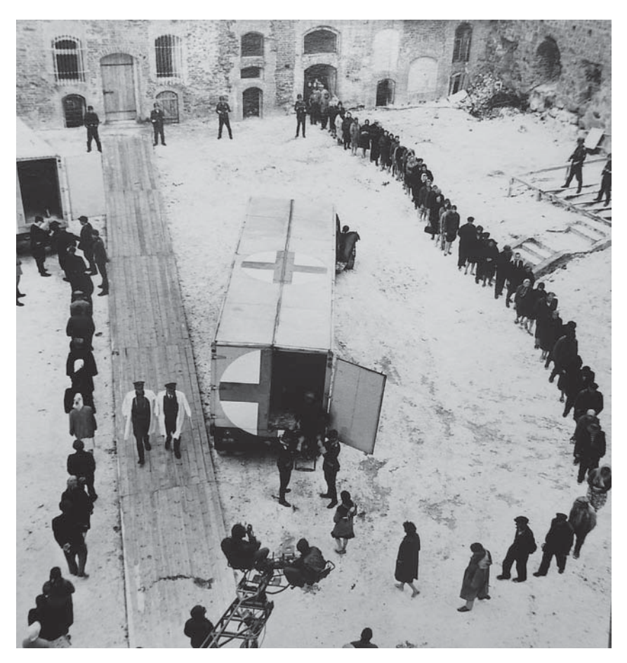
Figure 11.4 Eastern Corridor. A production still: filming of a scene in the prison's courtyard.

But it is too late: these prison scenes are intercut with the scene of ghetto liquidation. In the empty courtyard of the castle (which houses the prison and the ghetto), people are loaded into trucks with red crosses on them. It is clear from the dialogue that these trucks will take people to their death. Among the people waiting in line to be sorted is the old Grommer and Egor, the artist (who is imprisoned as a resister). Grommer ask him, "What should I say?" Egor: "Say you are healthy. They kill the sick ones." Despite the fact that he witnessed a horrible execution at the river, Grommer says, "It can't be. I heard that they send the healthy ones to Germany and the sick ones are allowed to remain here. I have