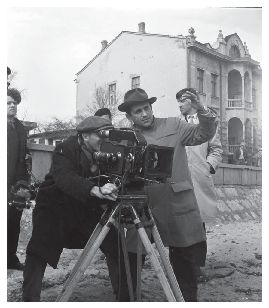
Figure 8.2 Goodbye, Boys! A production still: Mikhail Kalik (center) is directing the cinematographer.

In the early 1964, Kalik traveled with a crew to Evpatoriia. Most of the film was shot on location. Kalik recalls the filming there with pleasure: "We arrived in