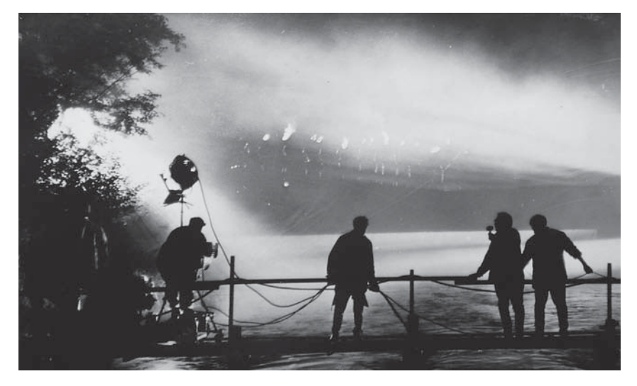
Figure 11.3 Eastern Corridor. A production still: filming of a drowning scene.

is particularly poignant here: Tsur Yisroel , which is recited daily after the Sh'ma prayer, is a plea for deliverance and redemption. With this prayer on their lips, the Jews are dying on screen.