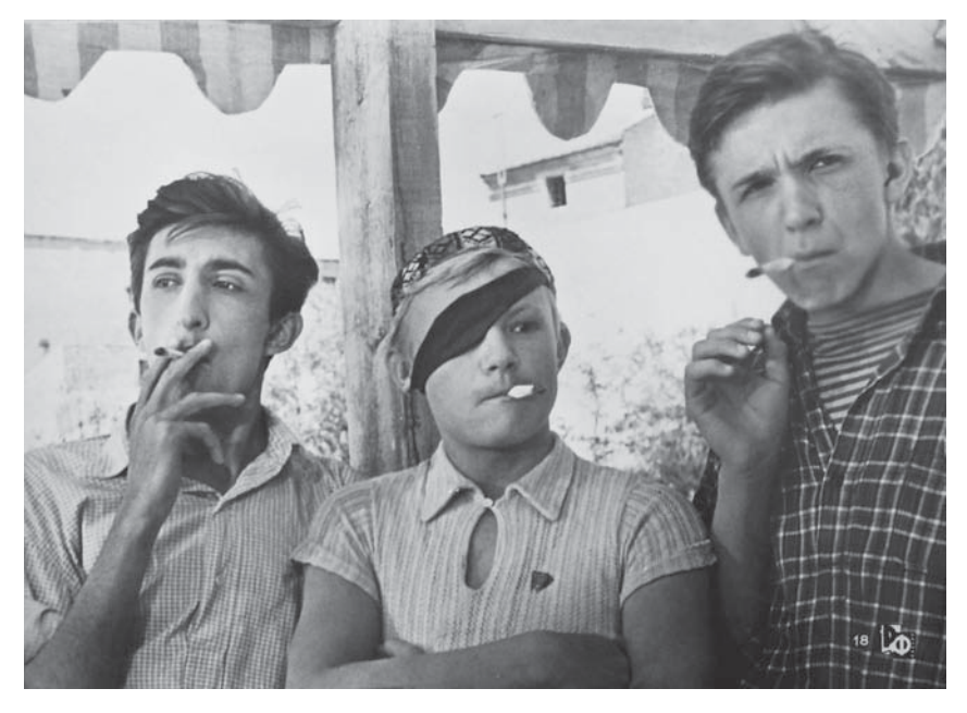
Figure 8.1 Goodbye, Boys! Three friends (left to right): Sashka, Vitka, and Volodia.

The film combines diegetic period music (popular Soviet songs performed on screen) and natural sounds (waves, snippets of conversations), and extradiegetic atmospheric music: a bittersweet piano melody by Mikael Tariverdiev, a famous composer who worked on most of Kalik's films. The visual imagery and the rich multilayered soundtrack create the atmosphere of the time. The overall effect is what Kalik himself calls "a cinematic impressionism."<sup>4</sup>