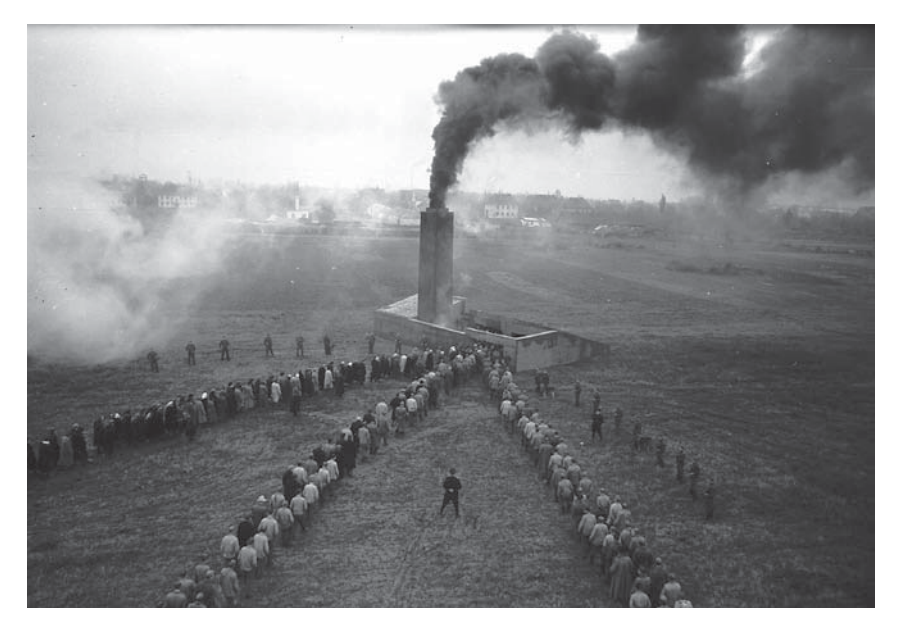
Figure 5.1 The Fate of a Man. A crematorium at work.

memories of his hungry childhood during the war, spent in an Uzbek village among refugees from all over the Soviet Union.<sup>16</sup> Abbasov recalls that there were many Jews among them.