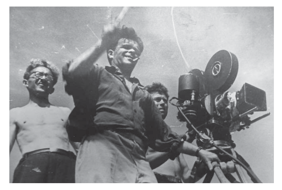
Figure 4.1 The Unvanquished. A production still: Mark Donskoi is in the center.

them. Jews appeared on Soviet wartime screens only as soldiers, and even then their representation was limited to either marginal characters (as in the melodrama Wait for Me ) or characters whose Jewishness was only implied (as in a combat comedy, Two Fighters ).<sup>10</sup> Jews as victims of Nazis had no place on Soviet screens. As Jeremy Hicks comments, "Soviet films are most eloquent about the exceptional fate of Soviet Jews in their silences, in what they do not show and do not say."<sup>11</sup>