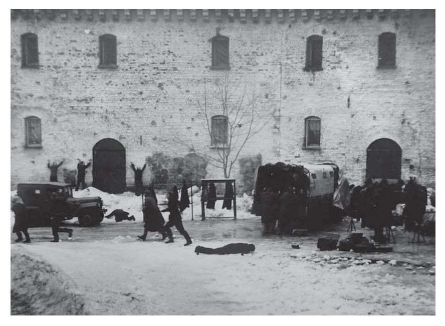
Figure 15.2 Our Father . An execution in a courtyard.