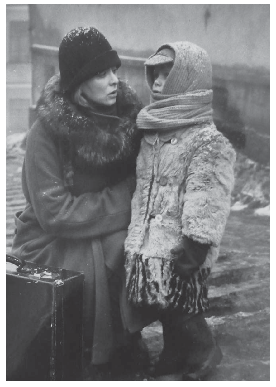
Figure 15.1 Our Father. A Jewish woman and her young son.