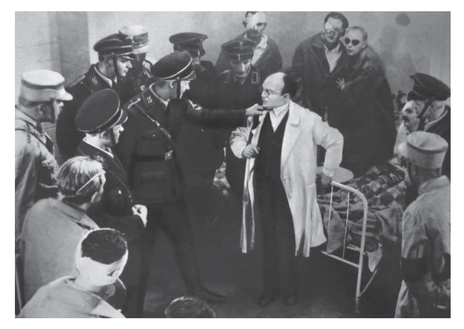
Figure 2.3 The Oppenheim Family. Storm troopers attack Dr. Jacobi.

over Germany.<sup>44</sup> Like Mamlock and Peat Bog Soldiers, The Oppenheim Family was shown in the United States. Unlike the Soviet critics, the Americans were unimpressed with the film, whose production values they found sub-par by Hollywood standards. But they did appreciate the progressive message of the film.<sup>45</sup>