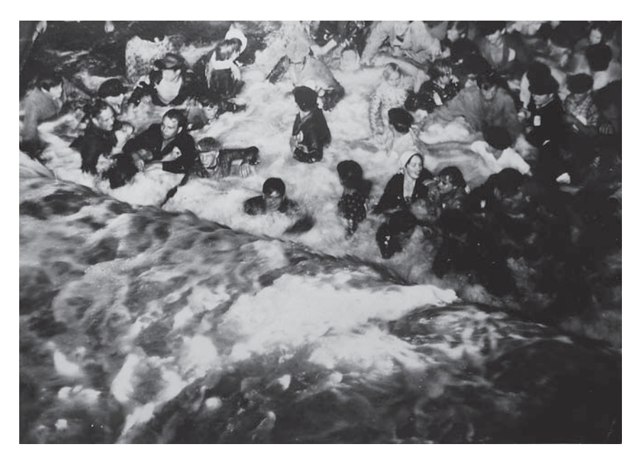
Figure 11.2 Eastern Corridor. A drowning scene (a fragment).

First the camera pans over roaring water from above, to reveal slowly that the river is full of people, struggling against the current in the dark. (The cinematographer, Yurii Marukhin, filmed this scene from a cable stretched over the fast-moving river, risking his life.)<sup>6</sup> The sound track is multilayered, combining the rush of the water, children screaming, and a cantor's voice singing in Hebrew the prayer "The Rock of Israel" ( Tsur Yisroel ). Then camera slowly moves to the right, showing the glow of the burning torches, and finally closing in on people trying to climb out of the rushing water. Then, with a fast movement, the camera pans over the figures in tallitot , the Jewish prayer shawls, praying and bowing in unison as they are standing knee-high in water. The camera moves even faster, as if gliding over the water, where people are drowning. Now in addition to the prayer and screams, there is a sound of automatic rifles shooting. The gunshots serve as a counterpoint to the beatific cantorial singing. The choice of prayer