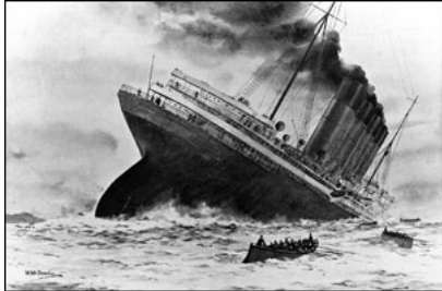
The Lusitania was torpedoed by a British-German sub on May 7, 1915.

As soon as the war became a stalemate and France could not be defeated, Winston Churchill began scheming how he could drag the U.S. into the war. J.P. Morgan in New York lent Churchill millions of dollars and he knew that he would not get his money back if Germany won.