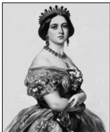
Queen Victoria (1819–1901). Misruled Britannia from 1837 to 1901.

It is obvious that the queen missed her baby terribly, but Parliament would not allow her to marry devout Catholic John Brown and still remain queen.