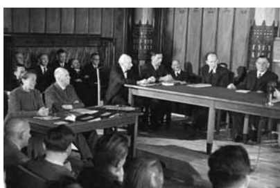
Winifred Wagner at her de-Nazification trial in 1947.

When the most destructive war in the history of the world was over, Winnie was arrested and charged with being an accomplice of Hanover.