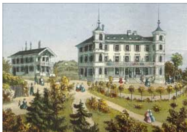
Villa Wallis in Lucerne where the queen began her "weight reduction" program.

The queen left Osborne House in the Isle of Wight on August 5 and crossed via yacht to Cherbourg, France. Emperor Napoleon III provided his special saloon train to take her to Paris. After a brief stopover in Paris, she arrived in Lucerne, Switzerland, on August 7.