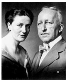
Siegfried (1869–1930) and Winifred were married in 1916.

It was a marriage of convenience only as Siegfried preferred the company of his male friends. The 46-year-old Siegfried was under pressure from his mother Eva to marry and produce heirs.