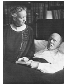
Chamberlain and Eva shortly before his death in 1927.

The racist writings of Chamberlain and the "music" of Richard Wagner laid the foundation for the Third Reich.