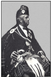
"John Brown" (1826-1883) accompanied his top secret spouse to Switzerland.

Queen Victoria, who later became known as the "Grandmother of Europe," gave birth to a top secret baby girl in Switzerland. The identity of that baby was as closely guarded as the top secret royal twins.