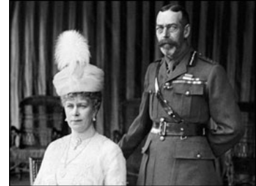
Hanover George V and Queen Mary became Windsors in July 1917.

In July 1917, he was appointed minister for munitions, and in the same month the House of Hanover became the House of Windsor.