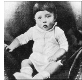
Baby Adolf Hanover/Hitler (1889–1962).

In 1889, Chamberlain arranged a marriage between Klara and a man named Alois Hitler. He became the surrogate father of baby Adolf.