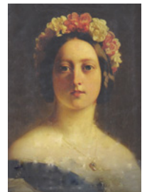
Franz Winterhalter's 1845 portrait of Queen Victoria.