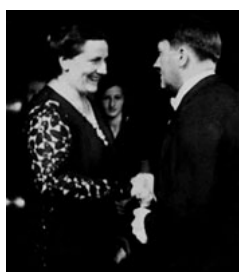
Winnie and Wolf sharing an intimate moment.

Hitler's only qualifications to lead Nazi Germany was the fact that he was a grandson of Queen Victoria!