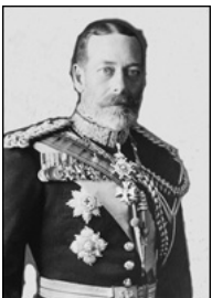
King George V (1865–1936). King from 1910 to 1936.

King George V, Kaiser Wilhelm, and Tsar Nicholas II were cousins. They were the protagonists in the worldwide conflict known as World War I.