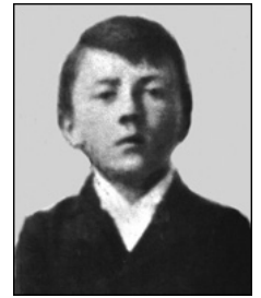
Adolf Hanover/Hitler aged 10.

Beginning in 1879, Chamberlain was stationed in Geneva, Switzerland.