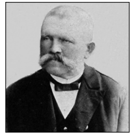
Alois Hitler (1837–1903) surrogate father of Adolf.

It is beyond belief but the name H-I-T-L-E-R contains all but 1 letter of the name L-U-T-H-E-R!