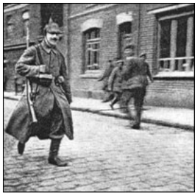
Adolf Hanover/Hitler as a "courier."

shelling was about to begin so that he could have a "miraculous escape!"