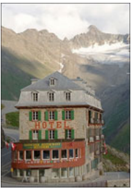
The Furka Inn today.

The baby was born in the high altitude Furka Inn.