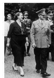
Winnie and Wolf at the opening of the Bayreuth Festival in 1937.

When Hitler became chancellor, he had to live in Berlin, but he visited Winnie at Bayreuth at every opportunity.