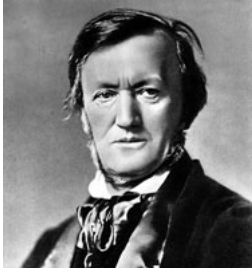
Composer Richard Wagner (1813–1883).

Even though he was thoroughly British, Chamberlain was enthralled by the music of German composer Richard Wagner. His son Adolf followed in his footsteps.