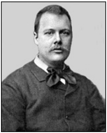
Houston Steward Chamberlain (1855–1927).

Houston Steward Chamberlain was a gung-ho British imperialists from the moment he was born. His father was a real admiral, and his mother was the daughter of a captain in the Royal Navy.