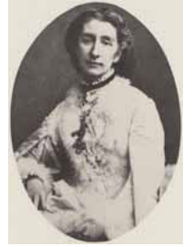
Cosima Wagner (1837–1930).

Wagner was the 19th century's equivalent of the Beatles as his opera music was considered revolutionary .