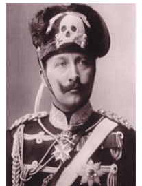
Kaiser Wilhelm II (1859–1941). Reigned from 1888 to 1918.

Unexpectedly, Tsar Nicholas II mobilized his forces faster than "Dead Head" expected.