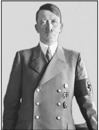
Führer Adolf Hanover/Hitler (1889–1962). Führer from 1933 to 1945.

In 1714, George I became the first king of the British Hanoverian dynasty. Queen Anne had 18 children, but not one of them survived to inherit the throne!