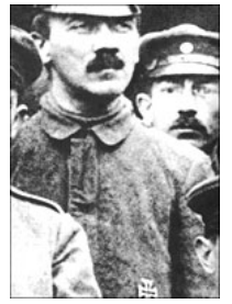
Hanover/Hitler decorated with the Iron Cross.

shelling was about to begin so that he could have a "miraculous escape!"