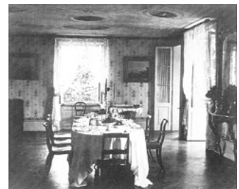
The Villa Wallis dining room at the time of Victoria's visit.

After 2 weeks in Lucerne, the queen felt challenged to seek even "higher ground."