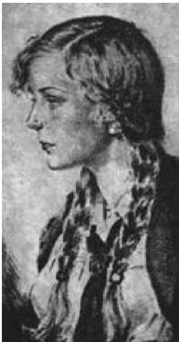
As a girl — pencil sketch by her brother Adolf

Paula, severely persecuted, and living in a miserable unheated room after WWII. Where was the ROTHSCHILD PROTECTION THEN????