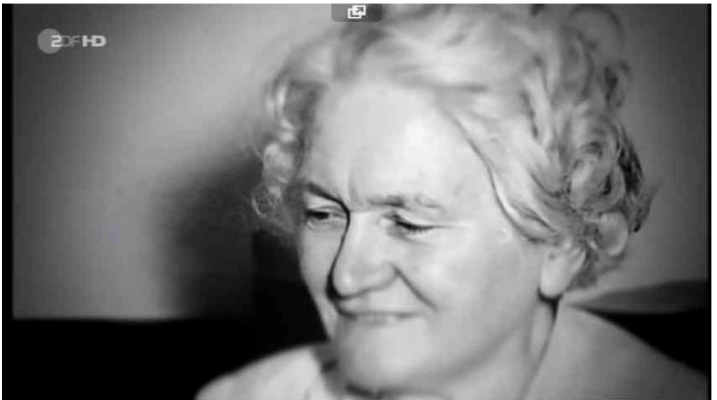
Adolf Hitlers Schwester Paula Hitler (Deckname: "Paula Wolf")

As a senior — does she look Jewish ??????????????????????