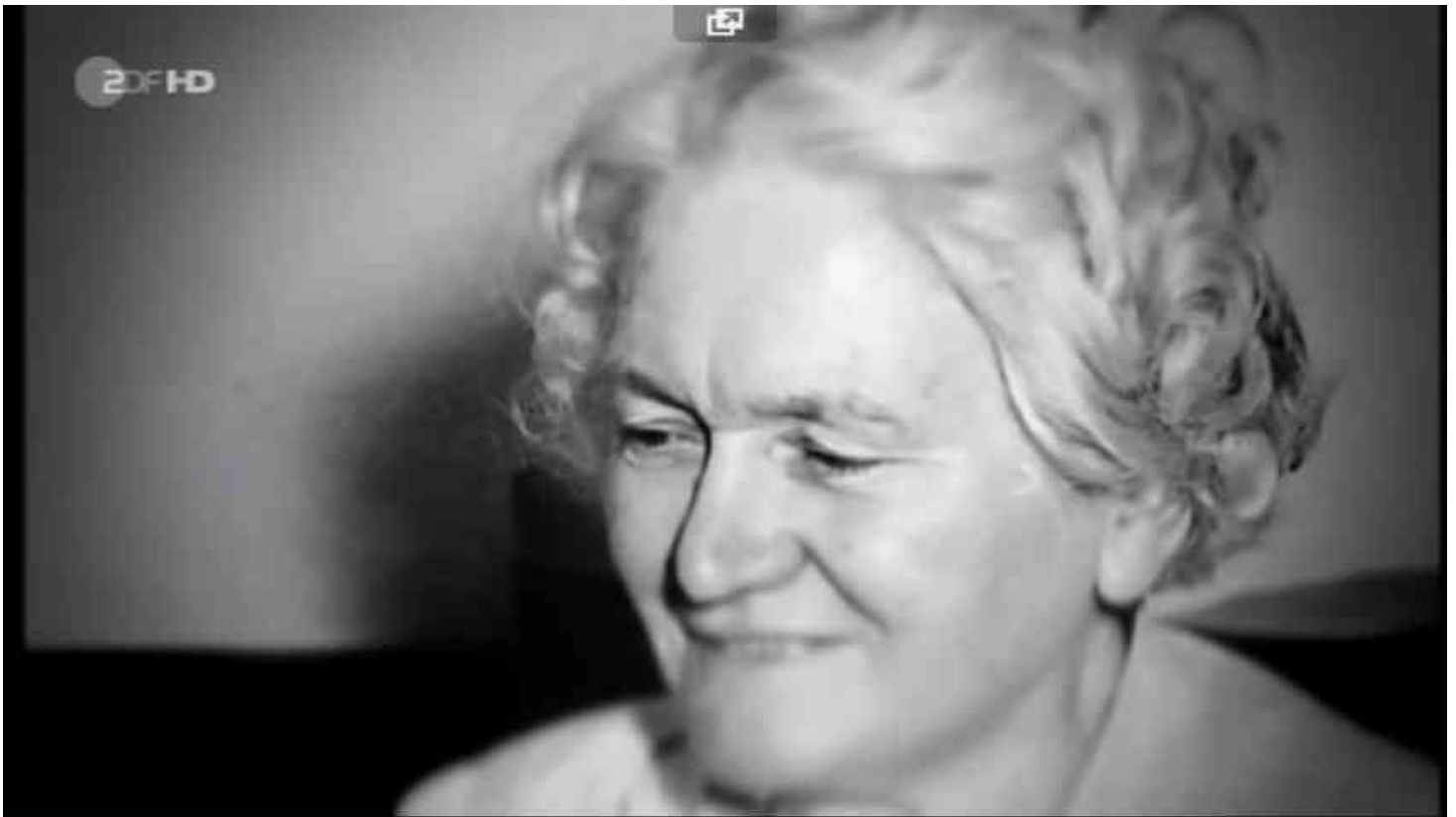
Adolf Hitlers Schwester Paula Hitler (Deckname: "Paula Wolf")

As a senior — does she look Jewish????????????????????