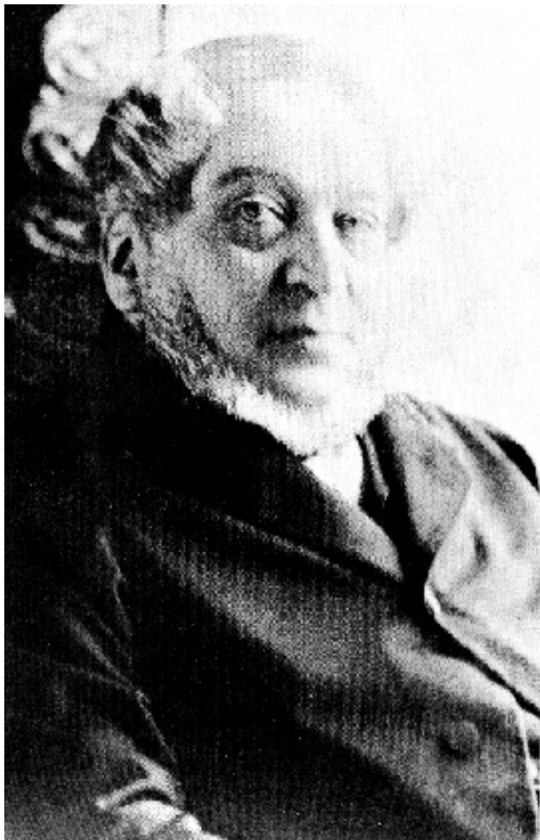
Nathaniel Rothschild, 1812-1870.

We noted earlier that the very first people to spread the canard that the Leader was Jewish were Hitler's opponents within the Movement. Thus it is sad but unsurprising that his present-day racist critics have tried to breathe new life into this falsehood. "Direct Action," a Canadian racist newsletter with National Bolshevik leanings, repeated the Hans Frank accusation as recently as December 1980.(17) It further charged that SS leader Reinhard Heydrich was also one-quarter Jewish, and declared that one of the real reasons that the traitor Gregor Strasser was executed at the time of the Roehm putsch was that he had "proof" of all this.' (18) The newsletter does not explain why Hans Frank was not executed by the SS, too, if he was also in possession of this elusive "evidence."