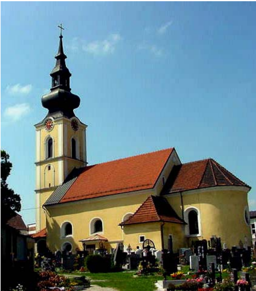
The church in Leonding, Upper Austria, where Hitler's parents are buried side-by-side

Unusual or not, the illegitimacy of Alois has served as a crucial factual base for those who seek to spread the falsehood that Hitler had a Jewish grandfather.