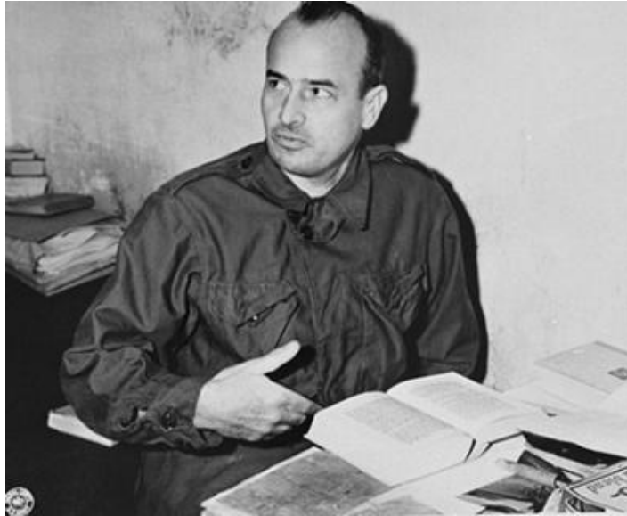
Hans Frank in confinement, 1945

The German-hating British historian Martin Gilbert wrote in his book Nuremberg Diary on p.19: "He [Hans Frank] and Albert Speer were the only defendants to show any true remorse for their war crimes ..." And they were the only two who spoke ill of Adolf Hitler in retrospect, the former in hopes to clear himself before God, the latter in hopes to clear his reputation before his new earthly rulers.