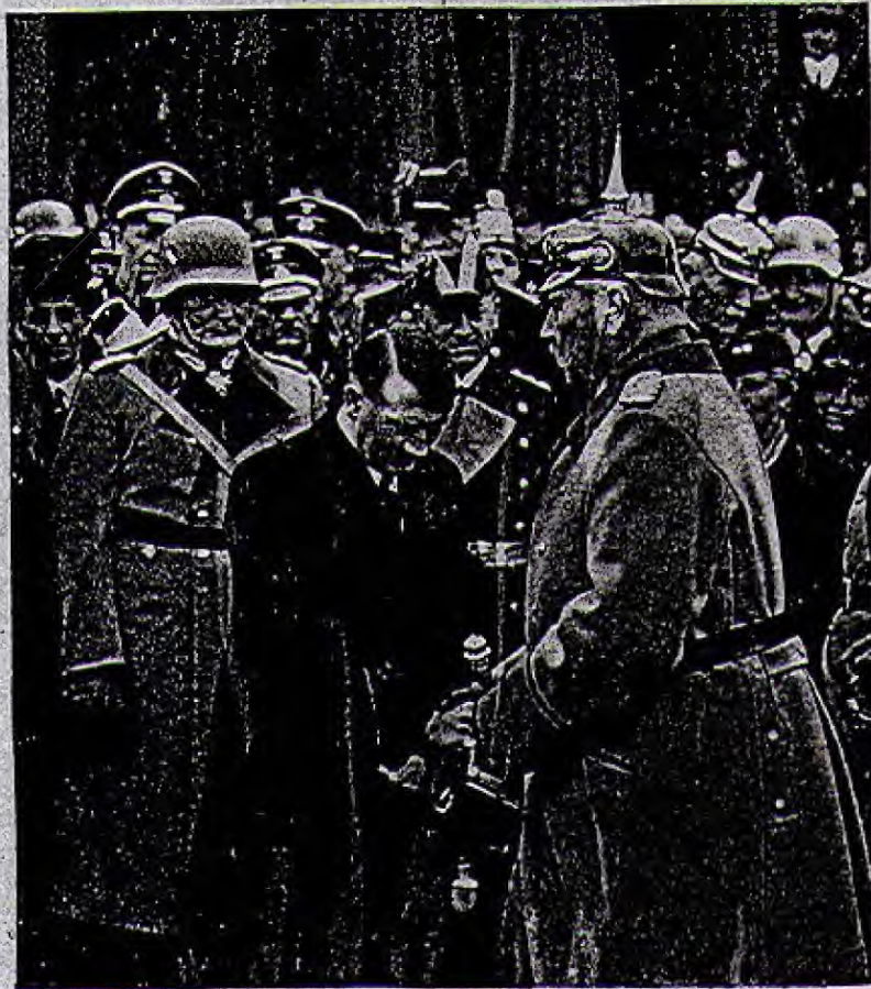
Hitler and President Hindenburg on the Day of Potsdam March, 1933

(ii) Strasser: Hitler's attitude towards the General was obsequious; he was in agreement with everything Ludendorff said.