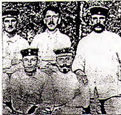
Hitler with fellow patients at Pasewalk, 1918

was after hearing the news of her capitulation that he had his vision of his task as savior. Suddenly his sight was restored.