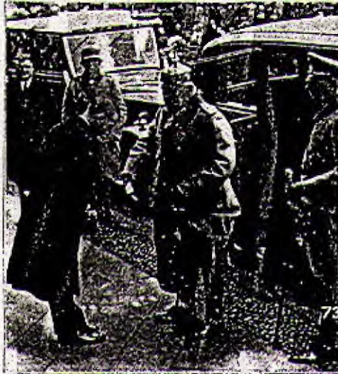
Note the subservience of Hitler's bow.

(iii) Heiden: In the midst of the Munich Putsch Hitler exclaimed to Kahr in a hoarse voice: "Excellency, I will stand behind you as faithfully as a dog!"