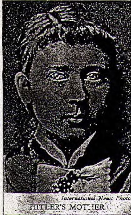
HITLER'S MOTHER

The mother was operated on for cancer of the breast in the summer of 1907 and died within six months. It is very likely that the disease was marked by ulcerations of the chest wall and metastases in the lungs.