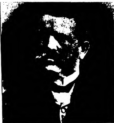
Alois Hitler -- Hitler's father. Note resemblance to Hindenburg.