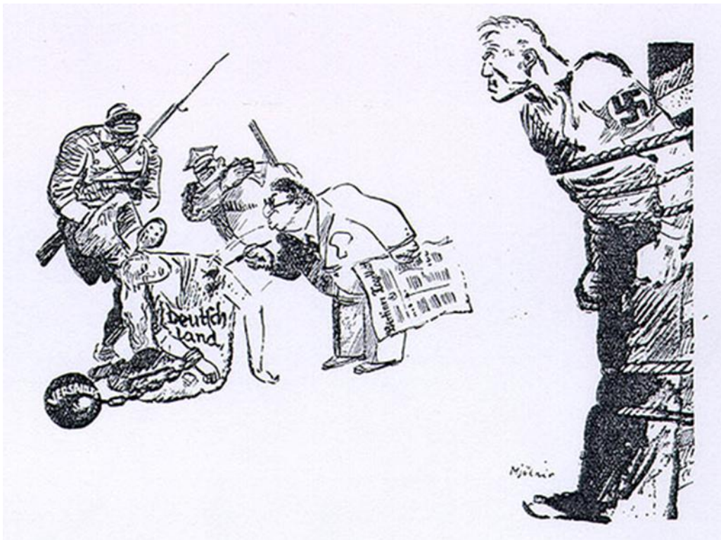
A tied-up Nazi watches while a Jew holding the Jewish-controlled newspaper Berliner Tageblatt mistreats a German chained to the Treaty of Versailles. The Jewish journalist smears Germany with his pen. A Black French colonial soldier and a policeman assist. The policeman is likely Polish, since Germany lost territory to Poland as a result of the Treaty of Versailles.