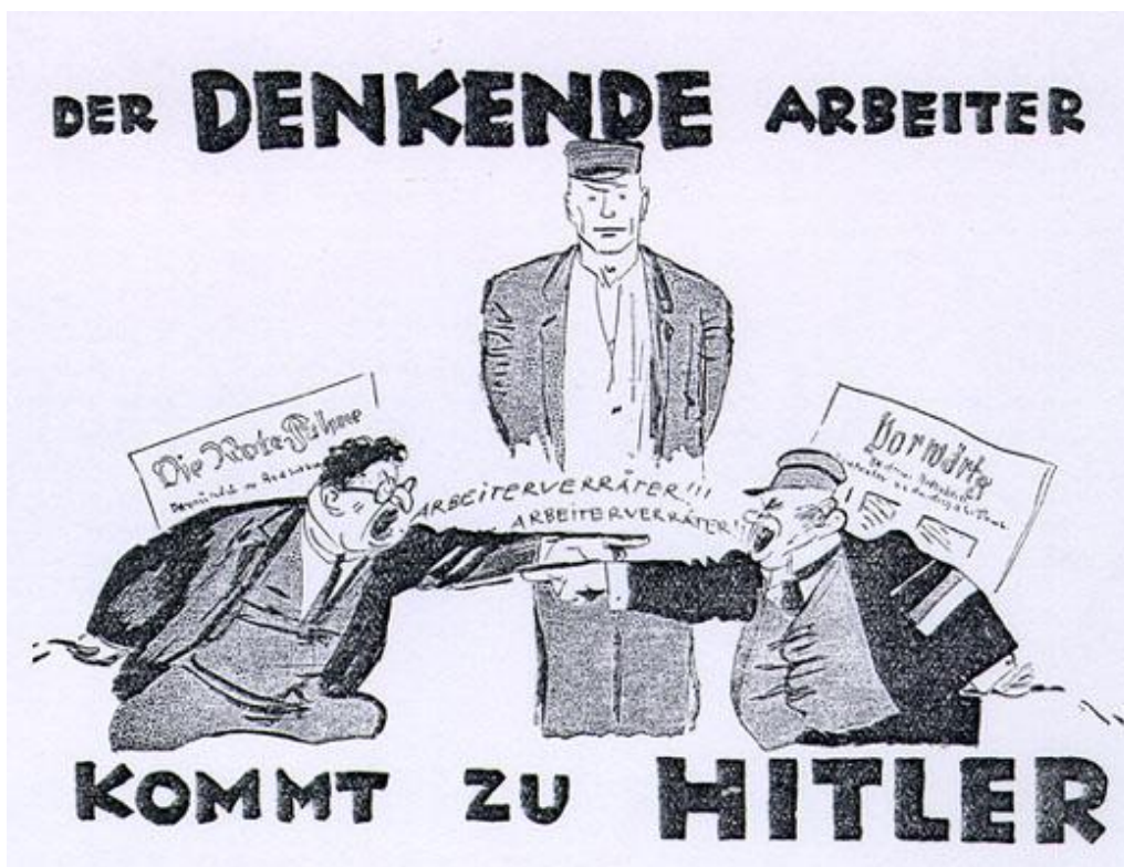
"The thinking worker comes to Hitler," the caption says. A communist and a socialist are accusing each other of betraying the working class.