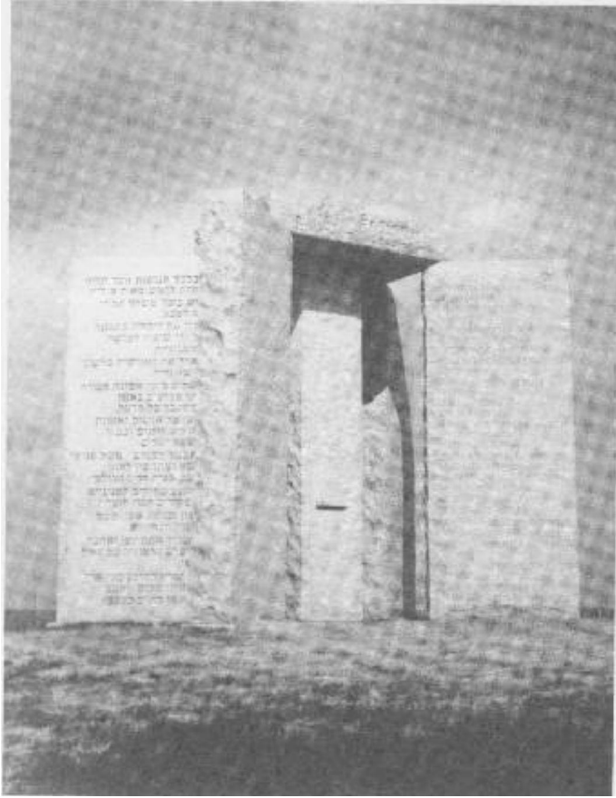
The Georgia Guidestones