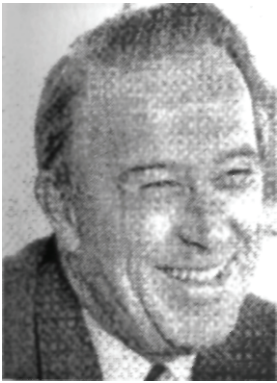
Senator Henry Jackson