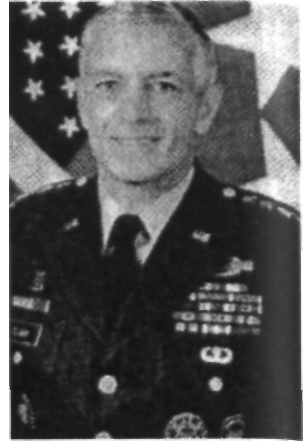
Wesley K. Clark