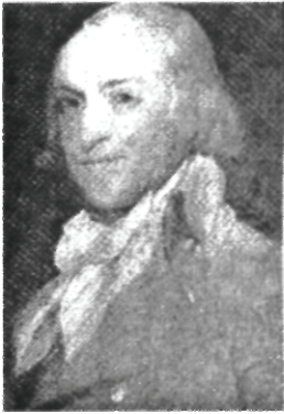
John Jacob Astor