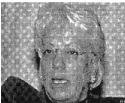
Carla Del Ponte