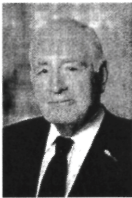
Walter H. Annenberg