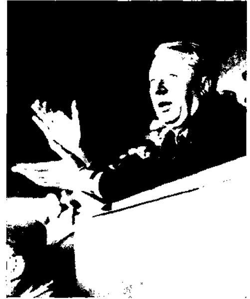
HEATH Full cry.