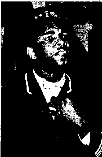
CASSIUS CLAY No battle at Verdun.

Even though he looks militant enough in the dress blues of the Fruit of Islam, the Black Muslims' Special Forces, Boxer Cassius Clay, 24, is a peaceful sort—as he loudly announced to the U.S. Selective Service when it reclassified him 1-A. "I don't have no quarrel with those Viet Congs," blared the Greatest. So the