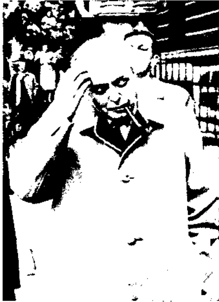
WILSON "nee handkerchief"

shields, the U.S. was understandably anxious to get them all back. To that end, seven hundred U.S. airmen, soldiers, civilian technicians and Spanish troops were scouring a ten-sq.-mi. coastal area near Palomares, and 16 ships—including three deep-sea subs—were combing the ocean floor. All they turned up were 200 chunks of metal, ranging from one of the aircraft's latrines to an old man-o'-war cannon ball.