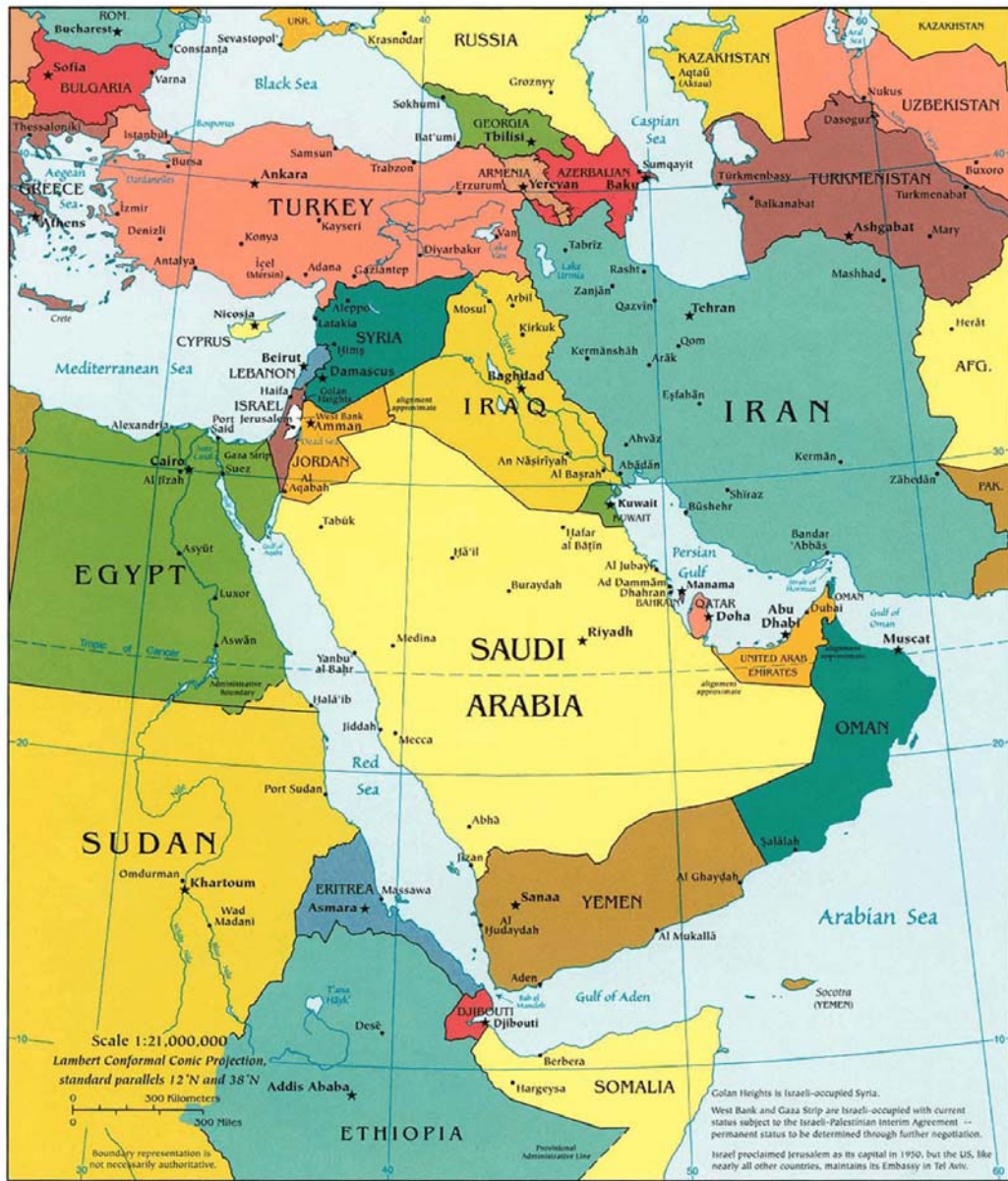
Figure 2. Map of Middle East