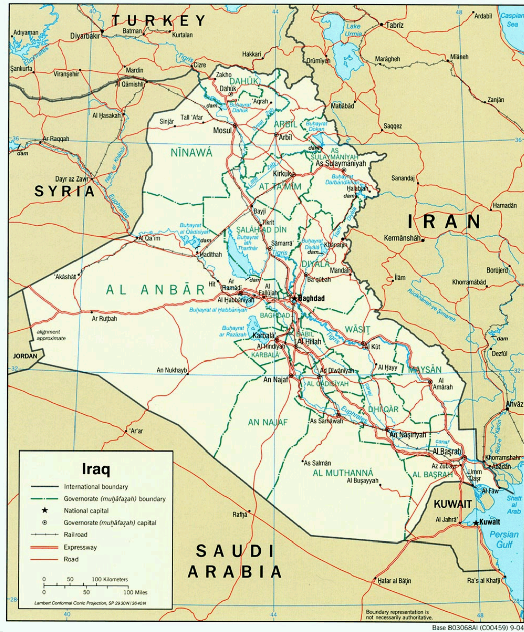
Figure 1. Map of Iraq