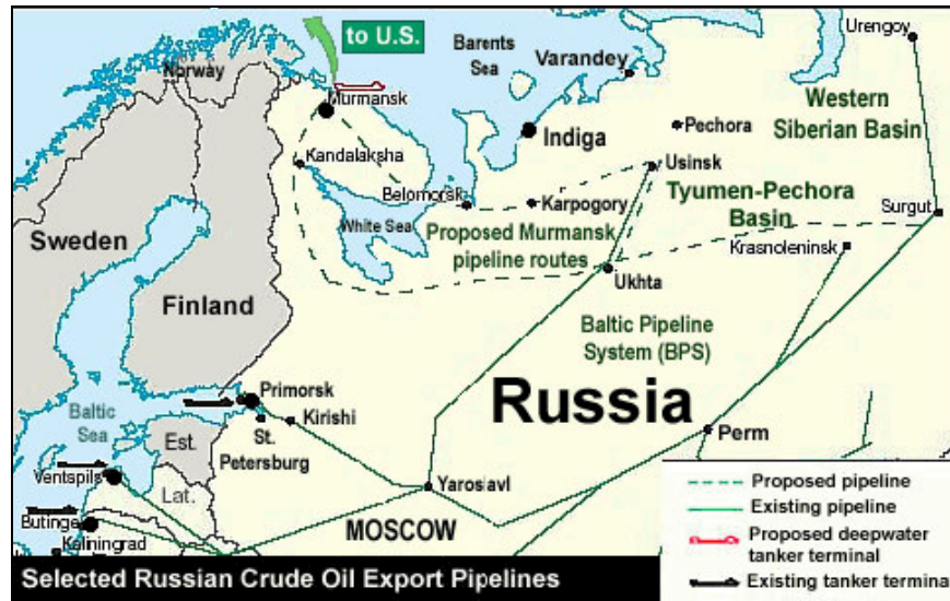
Figure 3. Selected Northwestern Oil Pipelines