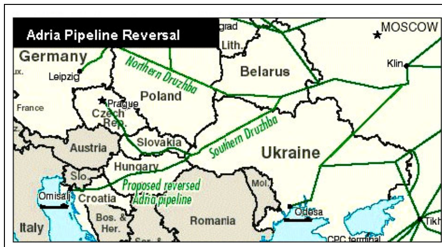
Figure 2. Druzhba and Adria Oil Pipelines