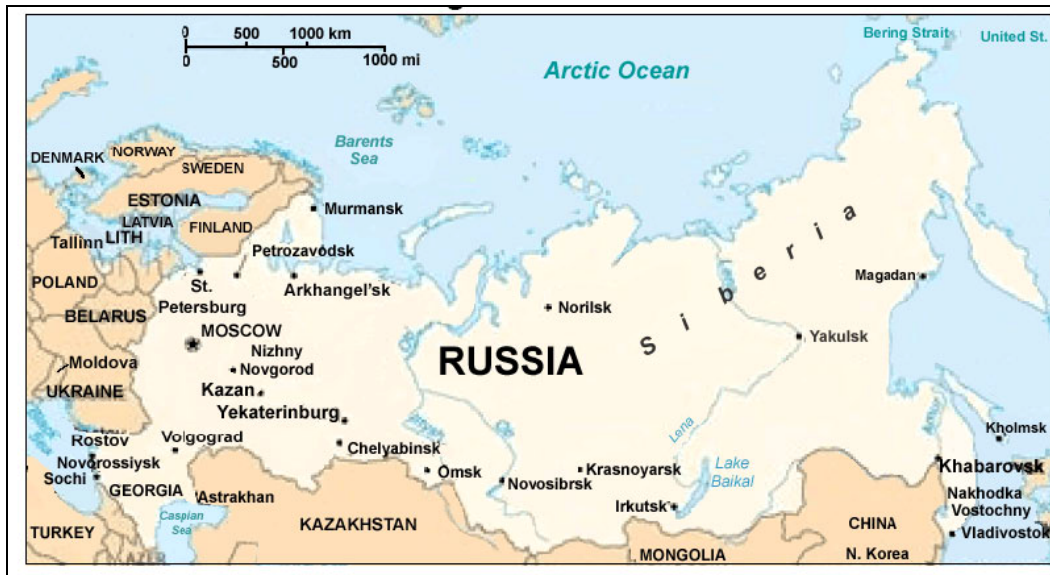
Figure 1. Russia