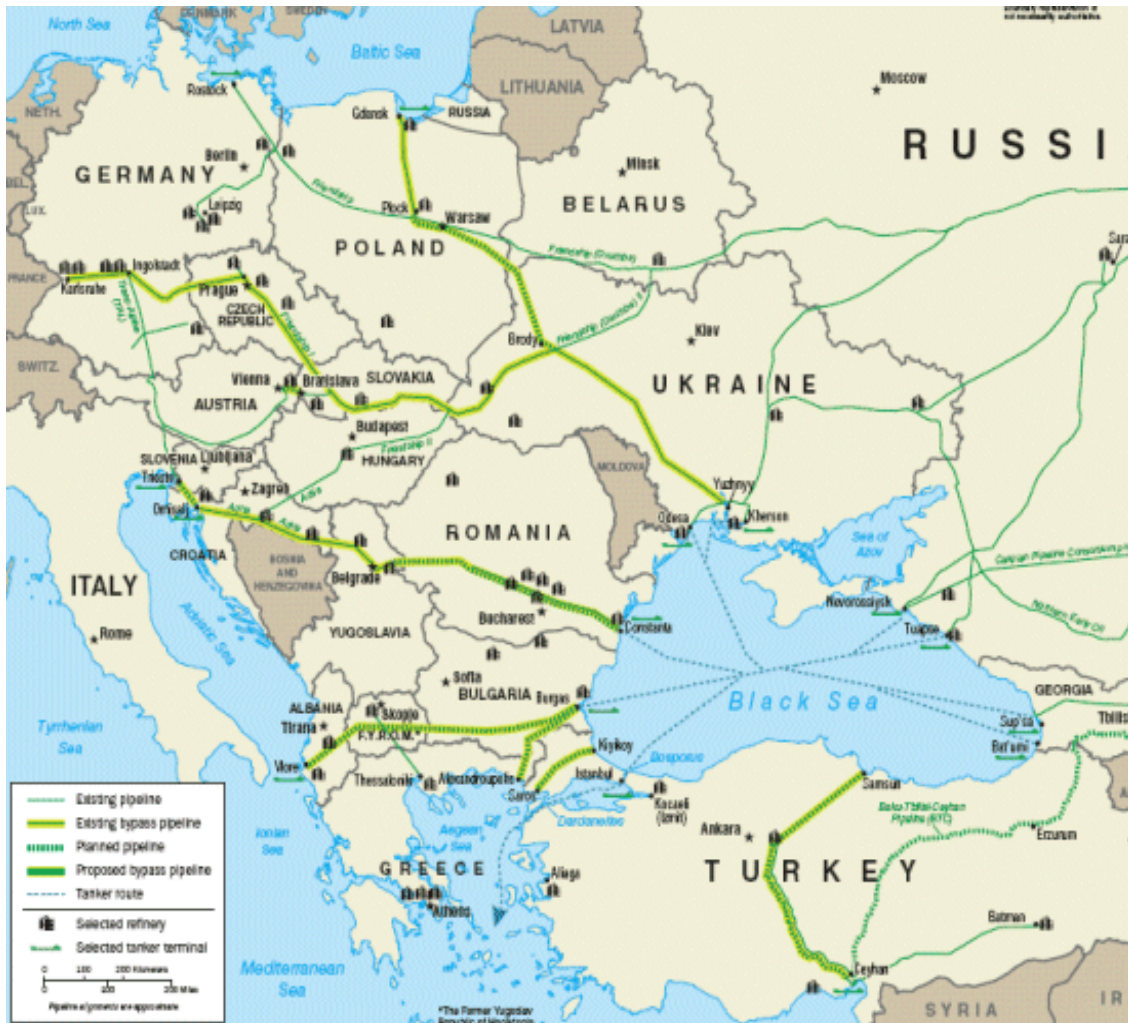
Figure 4. Proposed Bosphorus Bypass Options