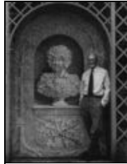
in his garden