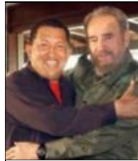
with Hugo Chavez

See also: " Top Chinese communist visits Fidel Castro "