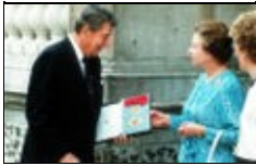
Queen Elizabeth II presents former American President Ronald Reagan with the Honorary Knight Grand Cross of the Order of the Bath insignia, 1989.