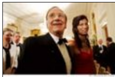
"When Wendi met Rupert"