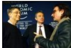
Bill Gates with the Catholic mason Tony Blair and controlled artist/'activist' Bono.