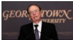
Georgetown University [10]