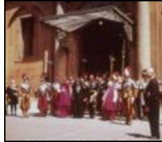
at the Vatican