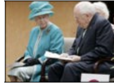
with Dick Cheney