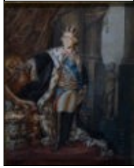
Emperor Paul wearing the Crown of the Grand Master of the Order of Malta (1799)