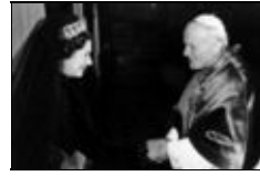
with Pope John XXIII with Pope John Paul II