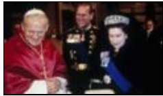
with Pope John Paul II