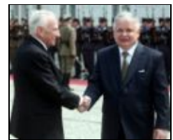
Hans-Gert Poettering (EU parliament president)