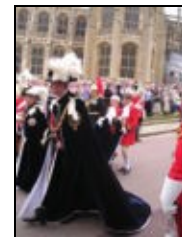
Order of the Garter procession