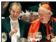
with Edward Egan (Archbishop New York)