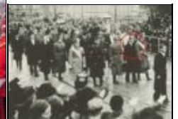
Nazi funeral, 1937