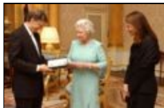
"Knight Commander of the Order of the British Empire"