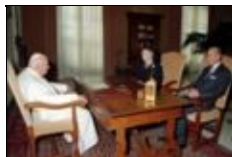
Pope John Paul II with Queen Elizabeth II and Prince Philip