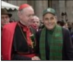
with cardinal Edward Egan (Archbishop New York)