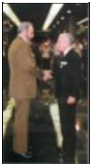
Fidel Castro with Andrew Bertie , the 78th Military Order of Malta "Grand Master"