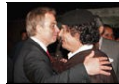
with Muammar Abu Minyar al-Gaddafi [11]