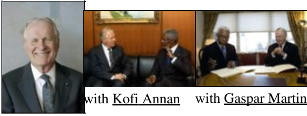
with Kofi Annan with Gaspar Martins ( United Nations permanent observer for Angola ) [9]