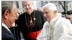
Pope Benedict XVI (right), shakes hands with (SMOM) New York City mayor Michael Bloomberg (left) while (SMOM) Cardinal Edward Egan , archbishop of New York, watches on the steps of St. Patrick's Cathedral in New York . (2008)