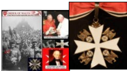
Order of the German Eagle service cross, instituted in 1937 by Adolf Hitler .