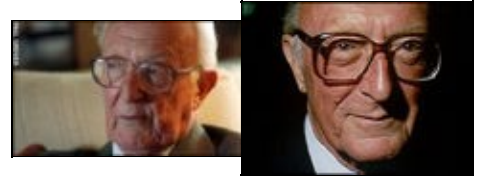
Peter Carrington, Robert Mugabe (Roman Catholic, Jesuit trained), Margaret Thatcher , 9th