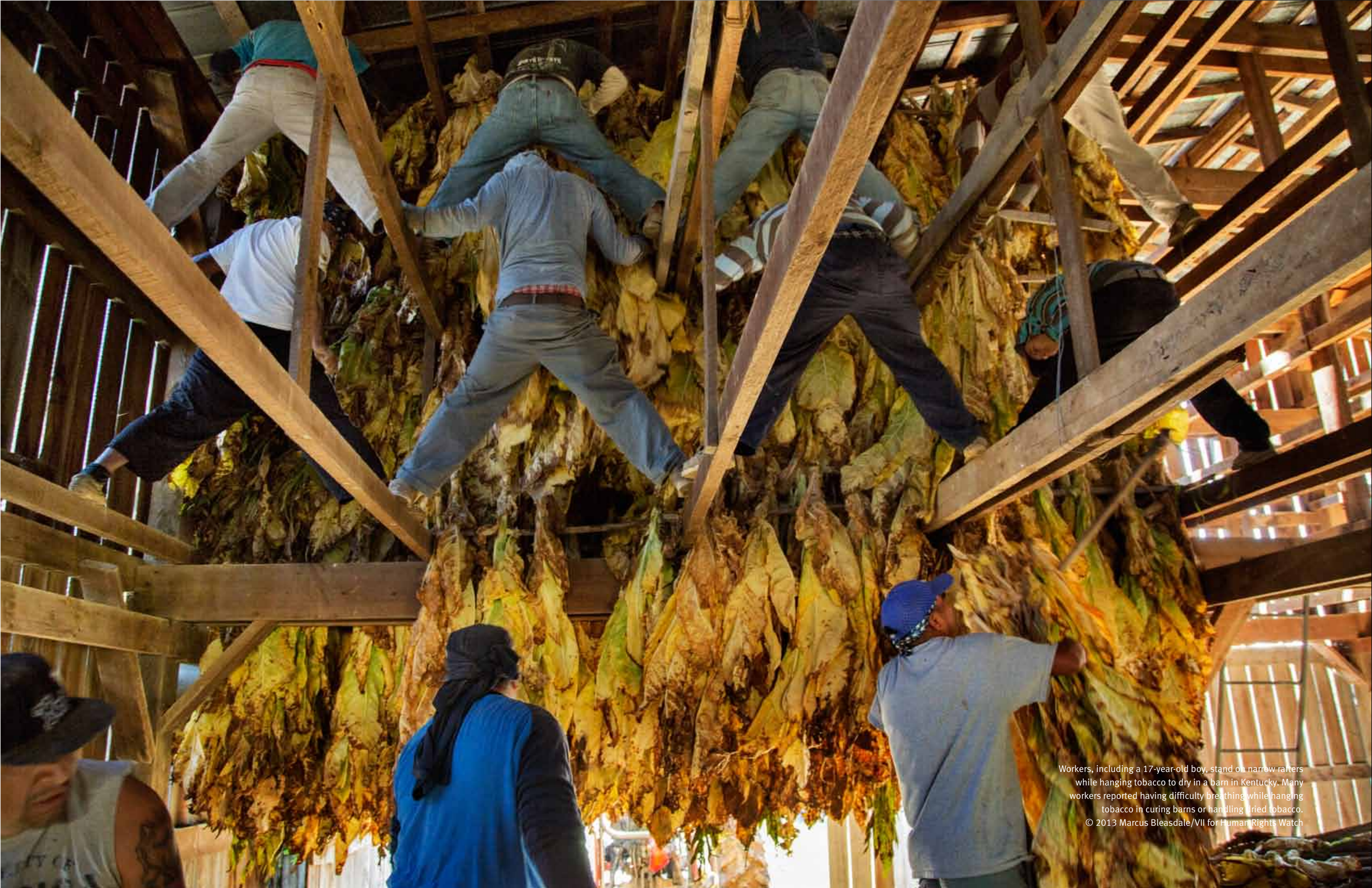
Workers, including a 17-year-old boy, stand on narrow rafters while hanging tobacco to dry in a barn in Kentucky. Many workers reported having difficulty breathing while hanging tobacco in curing barns or handling dried tobacco.