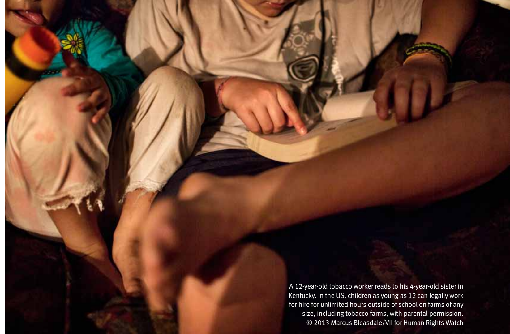
A 12-year-old tobacco worker reads to his 4-year-old sister in Kentucky. In the US, children as young as 12 can legally work for hire for unlimited hours outside of school on farms of any size, including tobacco farms, with parental permission.

Under US law, there is no minimum age for a child to begin working on a small farm with parental permission. At age 12, a child can work for any number of hours outside of school on a farm of any size with parental permission, and at age 14, a child can work on any farm