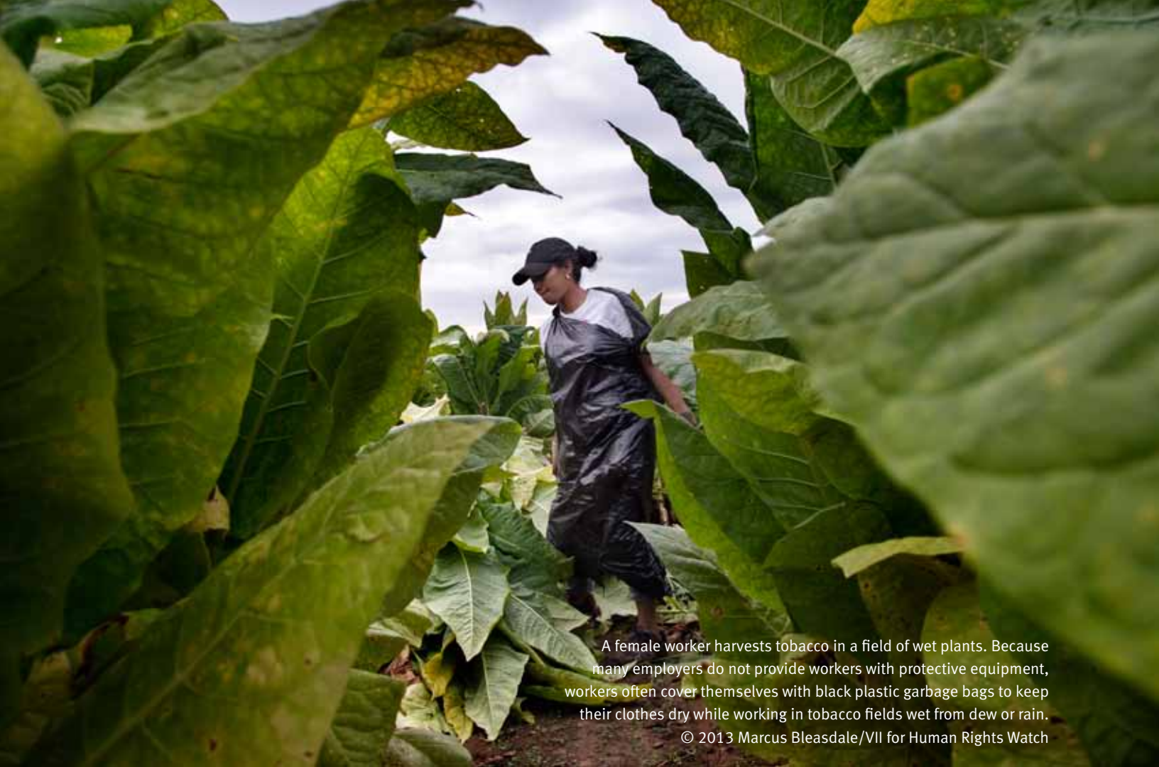
A female worker harvests tobacco in a field of wet plants. Because many employers do not provide workers with protective equipment, workers often cover themselves with black plastic garbage bags to keep their clothes dry while working in tobacco fields wet from dew or rain.

in a barn in northeastern Kentucky: “I’m short, so I had to reach up, and I was reaching up and the tobacco plant bent over, and I went to catch it, and I twisted my back the wrong way.” According to public health research, the impacts of repetitive strain injuries may be long-lasting and result in chronic pain and arthritis.