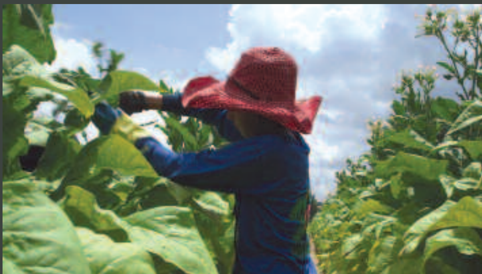
A 15-year-old girl works on a tobacco farm in North Carolina. July 2013.

Human Rights Watch calls on tobacco companies to enact policies to prohibit children from engaging in any tasks that risk their health and safety. Human Rights Watch also calls on the Obama administration and Congress to take action to protect children from the dangers of tobacco farming.