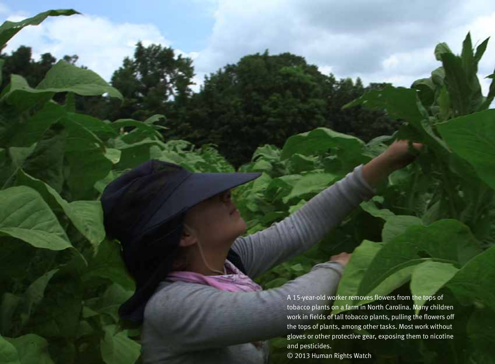
A 15-year-old worker removes flowers from the tops of tobacco plants on a farm in North Carolina. Many children work in fields of tall tobacco plants, pulling the flowers off the tops of plants, among other tasks. Most work without gloves or other protective gear, exposing them to nicotine and pesticides.