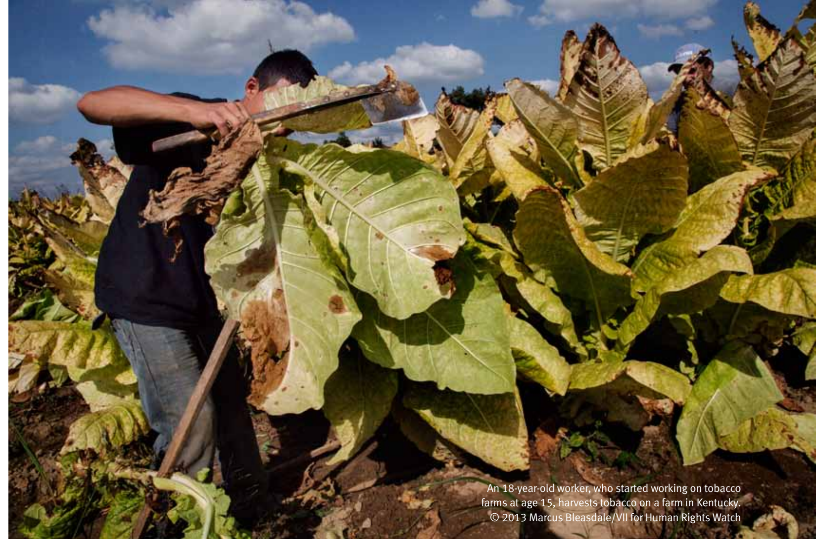
An 18-year-old worker, who started working on tobacco farms at age 15, harvests tobacco on a farm in Kentucky.

US laws and policies governing child labor in tobacco are inconsistent with or in violation of international conventions on the rights of children. The US government should acknowledge the particular health and safety risks posed to children exposed to tobacco plants and tobacco leaves, and take immediate action to end all hazardous child labor among children under age 18 on tobacco farms. It should also ensure that laws regulating child labor guarantee that the protections afforded to children working in other