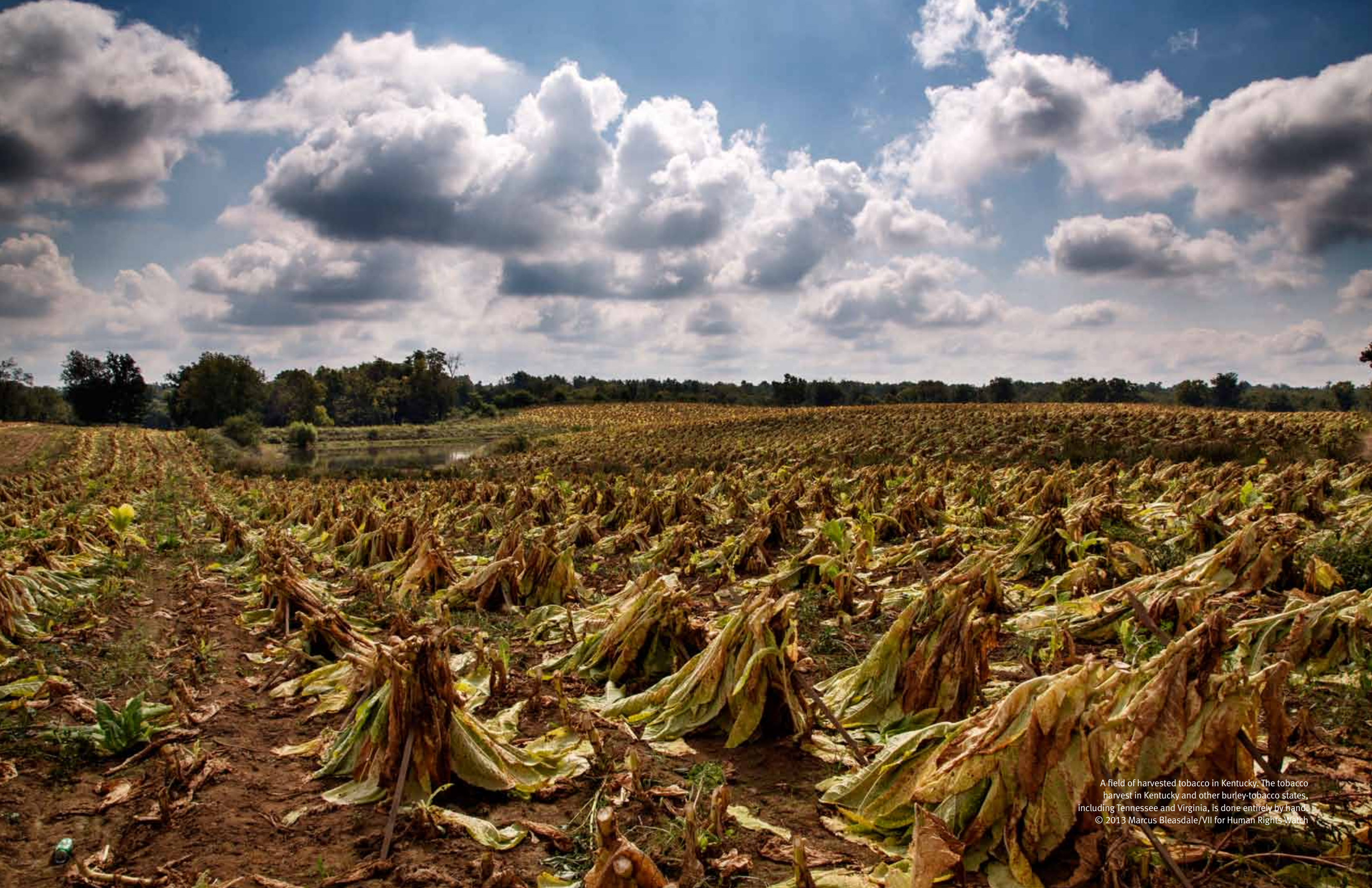
A field of harvested tobacco in Kentucky. The tobacco harvest in Kentucky and other burley-tobacco states, including Tennessee and Virginia, is done entirely by hand.