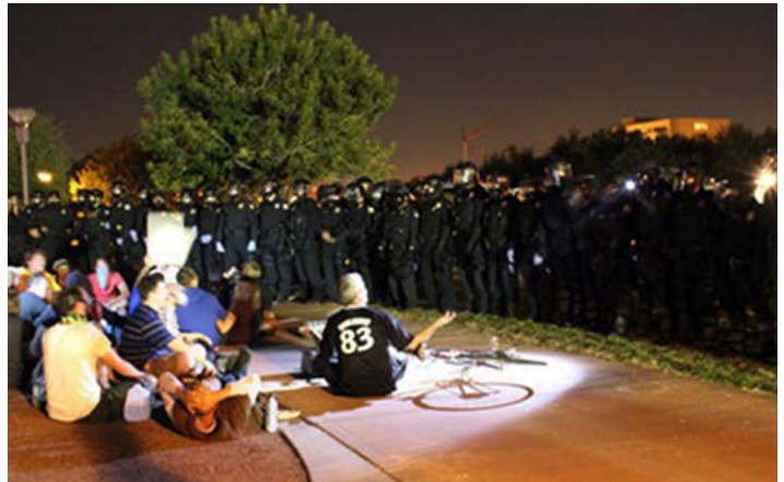
Phoenix Police Department “mobile field force” surrounds Occupy Phoenix protestors in Margaret T. Hance park on the evening of October 12, 2011.

[Note: despite the fact that public records requests submitted to PPD by DBA/CMD sought all records relating to ACTIC CLP (particularly those in possession