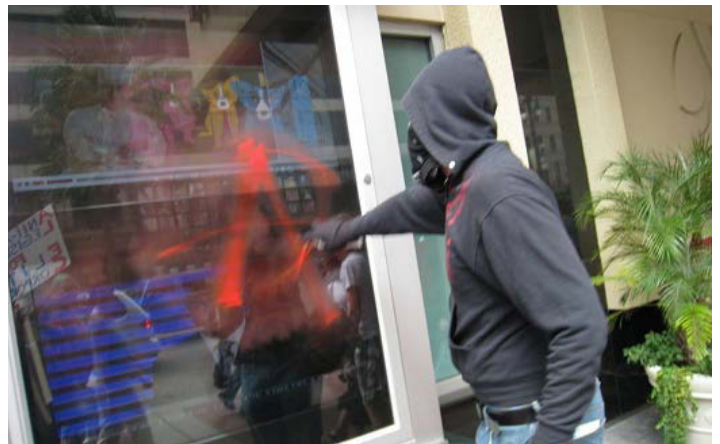
Protestor outside the Marriott New Orleans French Quarter Hotel “utilizing a can of spray paint to deface the property with an unknown symbol resembling the letter ‘A’ with a circle around it (in red color).”