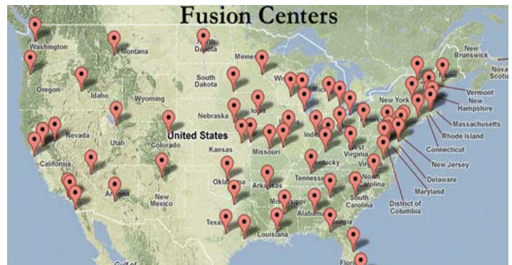
National Fusion Center Association map of fusion centers nationwide. Does not include all fusion centers.

ACTIC, commonly known as the “Arizona fusion center,” was established jointly by then-Arizona Governor (and current U.S. Department of Homeland Security Secretary) Janet Napolitano and the Arizona Department of Public Safety (AZDPS) in October of 2004 . ACTIC is best described as a “counter-terrorism”/“all-hazards” resources and information sharing center, consisting of personnel from more than 25 Arizona law enforcement/“public safety” entities and 16 federal agencies. Largely, local law enforcement personnel active in ACTIC (or other state/regional fusion centers) are employed in such “homeland defense”/“homeland security,” “counter terrorism,” or “intelligence” units of their respective agencies. These units, by and large, were created as “counter terrorism” entities in response to the terrorist attacks of September 11, 2001. Such local entities active in ACTIC include the AZDPS Intelligence Bureau, PPDHDB, the Tempe Police Department Homeland Defense Unit, the Mesa Police Department Intelligence and Counter Terrorism Unit, and the Maricopa County Sheriff’s Office. These local entities are joined through