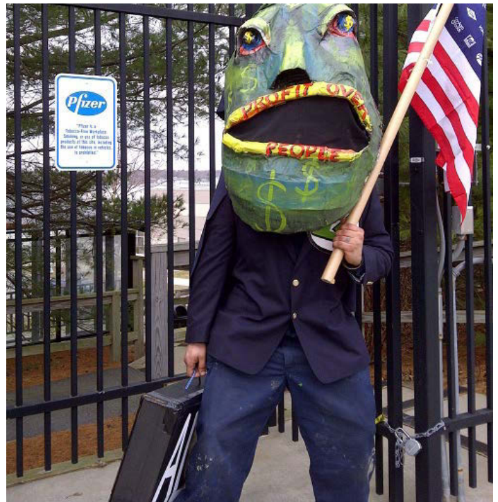
F-29 protestor outside Pfizer facility in Connecticut.

“Attendance could range from 20 to 150 demonstrators. The group plans to have giant puppets and pinatas as part of their demonstration. [paragraph break] There may be mild traffic interruptions but no significant disruptions are expected,” added Dowhan.