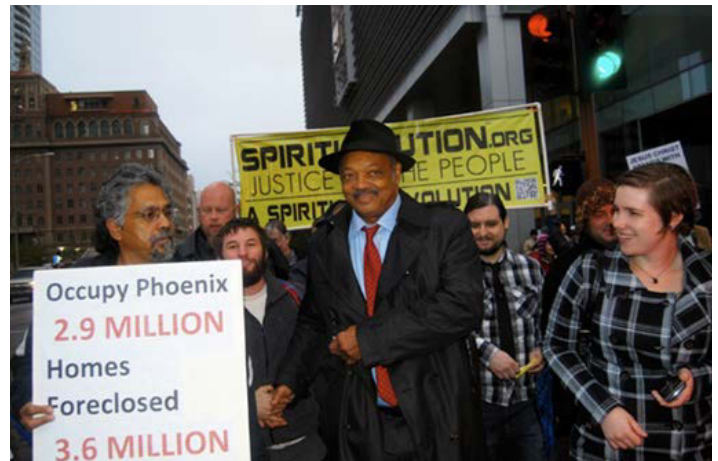
Reverend Jesse Jackson marching with Occupy Phoenix on December 1, 2011.

Records obtained by DBA/CMD show that this event had been on the radar of PPDHDB personnel as early as mid-November, 2011. In a November 15 email [1, p. 5] (Appendix, p. 188) to PPD Downtown Operations Unit (PPDDOU), Community Relations Bureau (PPDCRB) and PPDHDB personnel, Assistant Police Chief in charge of the Homeland Security Division