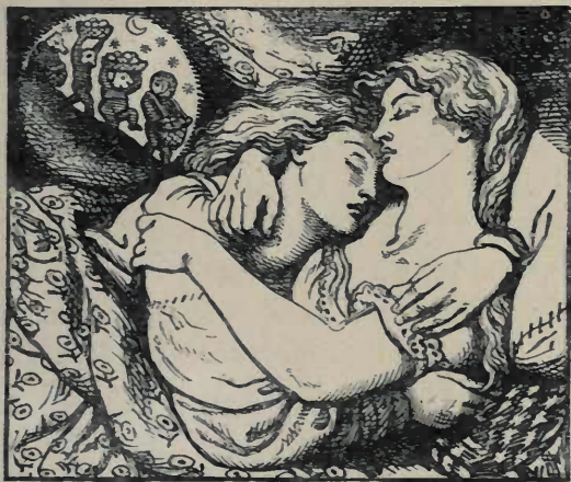
"Golden head by golden head"

brilliant tour de force ; but it is nevertheless infinitely superior to the earlier efforts of Kenny Meadows in 1843, and also to the fancy designs of Harvey in Knight's "Pictorial Shakespeare." The "Illustrated Tennyson" of 1858 is also a remarkable production. The Laureate, almost more than any other, requires a variety of illus-