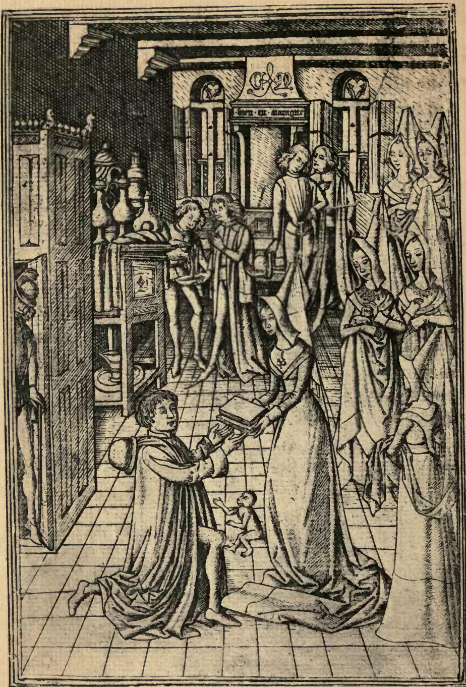
Engraving of an Author, possibly CAXTON Presenting a Book to Margaret, Duchess of Burgundy, prefixed to the Chatsworth copy of the 'Recuyell.'