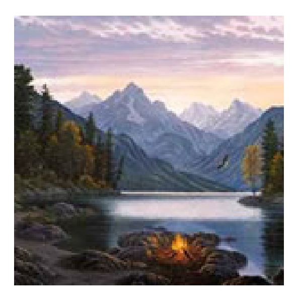
Talks in Eerde Castle, Holland, 1927