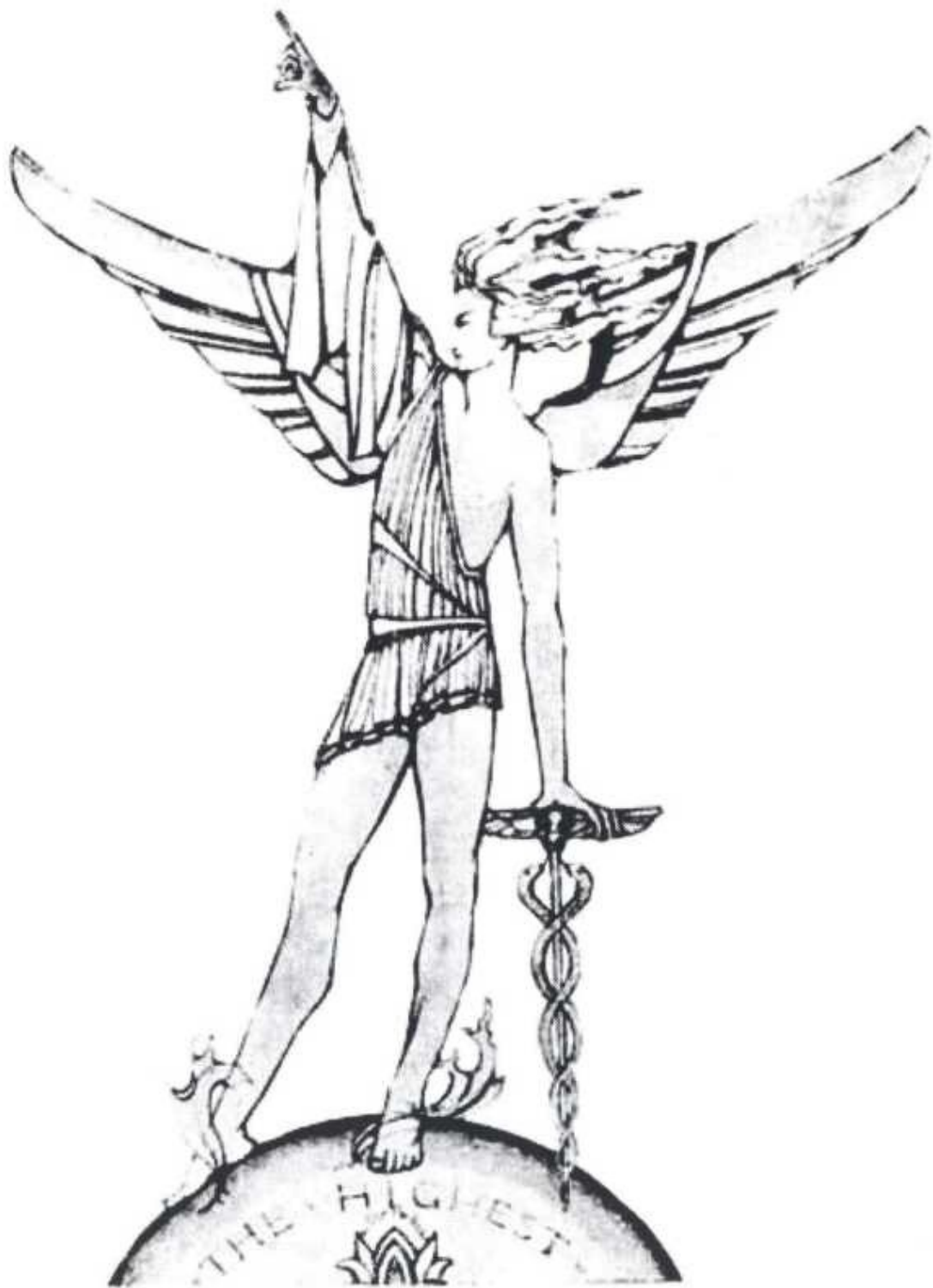
THE ANGEL OF THE POINTING HAND