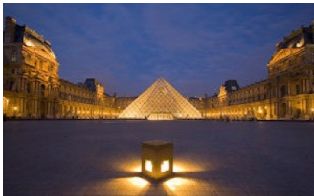
The Louvre courtyard: Surrounded on three sides by the Museum.

Thousands of human beings are being led into the pyramid at the Louvre but it's not for their own benefit in my opinion. Far from it. The fact that the Louvre is full of ancient symbolic monuments, that literally surround the pyramid, only confirmed my thoughts that spiritual energy extraction is taking place. Please look at the picture below.