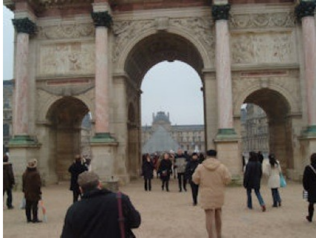
The Arc de Carrousel (glass pyramid through middle arch)

palace). Let me point out that the funfair Carrousel's are usually located near the Ferris wheels at Winter Wonderland events all around the world. I also believe that the Arc de Carrousel symbolism from the Paris energy line is represented around the world by the carousel funfair ride and the same funfair ride is symbolically on a par with the Ferris wheel. Here is the Arc de Carrousel in Paris and it was the next monument on the Paris energy line, known as the Axe Historique, that I came to.