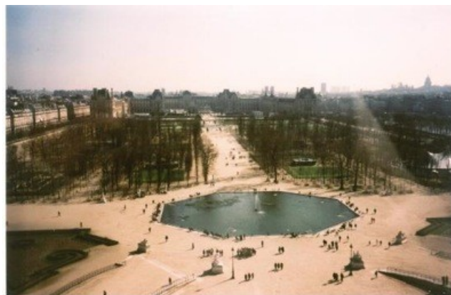
A picture of the Hex shaped pond taken from the top of the wheel looking down towards the Louvre museum. (Glass pyramid and Arc de Carrousel)

Obviously I couldn't see the geometrical shape of the pond from ground level and I also want to show you the location of this wheel, in the energy line in the best way possible. So look at these pics below