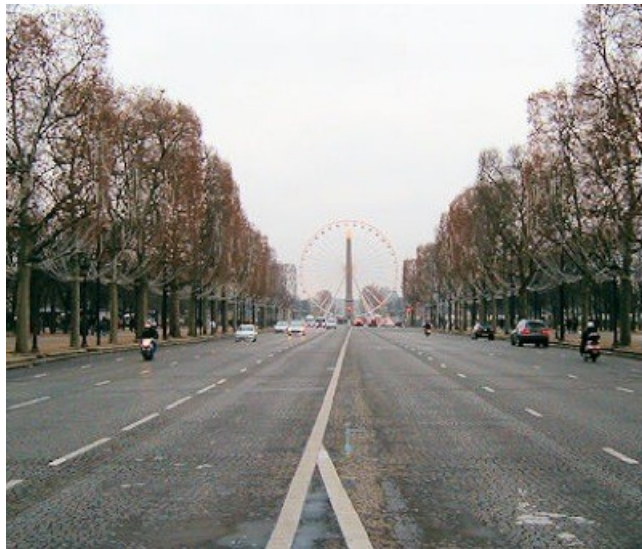
A Ferris wheel at the ‘bottom’ of the Champs-Élysées behind the obelisk

It was a far cry from the dog shit laden streets of Lancashire where I had travelled from that was for sure. It soon became apparent to me that the monuments were indeed in a ‘dead’ straight line but something hit me straight away as I strolled down the Champs-Élysées in daylight and it was not in the David Icke YouTube clip linked earlier. What is it? You might ask? . Well my little bunch of eager truth seekers it was a walloping great big massive Ferris wheel. Yes they have plonked one, on and off, smack in the middle of the Champs-Élysées (Place de la concord) behind the famous 3000-year-old obelisk that is originally from a Sun Temple in Luxor, Egypt.