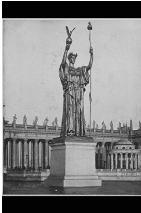
The Republic Statue (Chicago Worlds Fair)