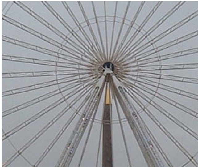
The pyramid and the eye!

This symbolism is exactly what I saw in Morecambe in 2004 but here now it is on display in Paris for you all to see. Now then, is it a paranoid delusion that I associated the Ferris wheel with illuminati symbolism? If so do you now suffer from the same delusion? Well do you? This is illuminati symbolism in the extreme and illuminated Ferris wheels represent the same symbolism.