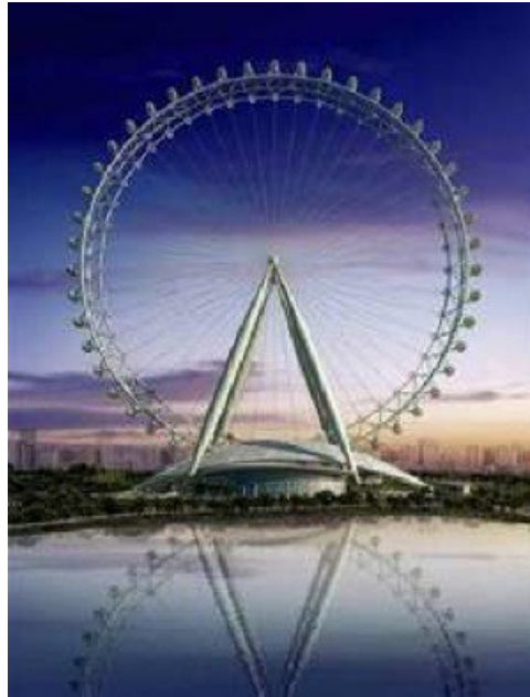
Behold the Great Wheel of China