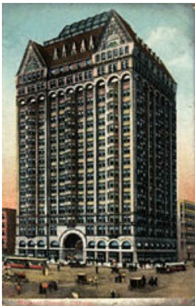
Masonic Temple Building in Chicago built by Bro Daniel Hudson: Enough said?

The Ferris wheel was also created for the World Fair in Chicago (1893). It appears to me that the secret societies actually arranged the layouts of the symbolic buildings and symbolic monuments that were used at all World Fairs and the World's Columbian Exposition (another name for the Chicago World's Fair) are no exception. Indeed a bloke named Daniel Hudson Burnham played a big part in the Chicago Exhibition. I don't want to drone on about him, and you can click on his name to know more about him, so I will just say that he built this.