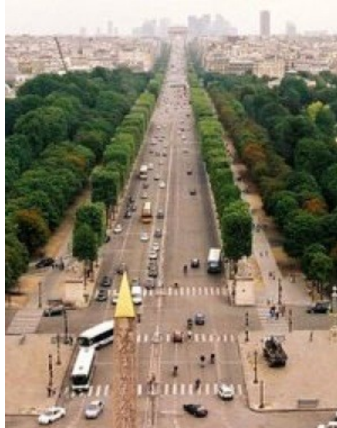
A picture taken from the top of the wheel looking up to the 3000 year old obelisk and the Arc de Triomphe.