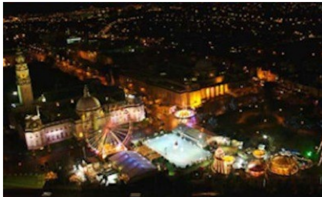
Winter Wonderland 'Cardiff': Ferris wheel placed next to symbolic buildings

I could many fill many pages just showing you many city centres that are using these things near older established monuments, obelisks etc, especially leading up to the winter solstice and they are usually hidden in Winter Wonderland promotions. Here is a picture of Cardiff's Winter Wonderland.