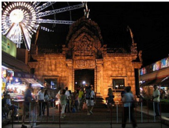
The portable Paris wheel in Bangkok (top corner) and the ancient Temple. Are you clicking on yet? I suppose they could stick their symbolism right up our arses and we'd still say it got there by coincidence wouldn't we?

Obviously it could all be a coincidence but the coincidences are growing all the time and I assure you more 'coincidences are planned as we speak'. Also let me point out that the Paris Ferris wheel is obviously taken from the Champs Elysees 'energy line' and placed on other energy lines time and time again. Is it possible that spiritual energy can be collected and released by the portable Ferris wheel when it is placed in other symbolic areas? Just a thought. The Paris Ferris wheel is made stable using water tanks. So it is literally always rising out of the water wherever it is placed. It has appeared in many places but always goes back to Paris. Here is a picture of it near a replica of an ancient Temple in Suan Lum Bangkok. Wakey Wakey!