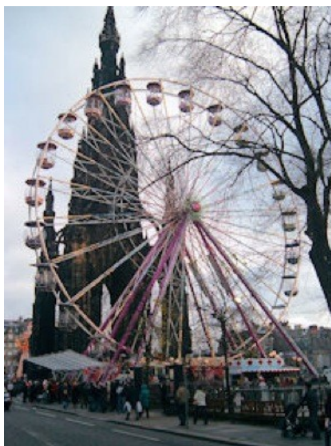
A Ferris wheel and Carrousel appears in Edinburgh next to the Scott (Freemason) monument.

So then baring everything in mind can you accept that if you placed a Ferris wheel in the middle of two statues it would be on a par with putting an obelisk and a sun disc in the middle of them? Let me demonstrate what I mean with a couple of pictures I took on my recent travels. I could have gone to most major cities in the world, especially with the dramatic increase in the use of Ferris Wheels in recent years. Have a look at these.