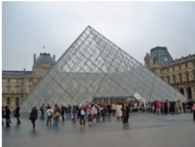
The glass pyramid at the Louvre. Nothing 'Illuminati' involved about that then eh? taken during early morning.

I then moved through to the Louvre glass pyramid and the museum.