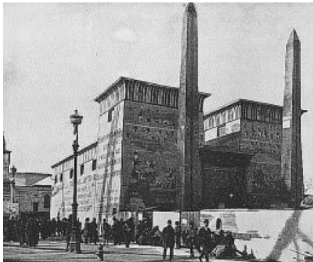
Replica of the Luxor Sun Temple (Chicago Worlds Fair)

I am convinced that the World Fairs were used for the use of occult symbolism and monuments for the affect they had on the mass consciousness of the time. It is hard to get all this information to you but I am very please to say I found a little video on the net about the World's Fair in Chicago and although it is based on the growth of the USA as a world power and imperialism the creators of the video are asking serious questions as to the real role of the world fair. But so am I. Please click here to watch the video. (Please don't be put off by the comic side of this video please watch it through)