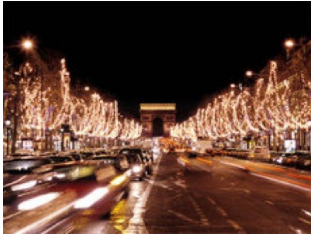
The busy Champs-Élysées at night showing the Arc de Triomphe

Basically the monuments in Paris are clearly in a dead straight line and it is said they are laid out on ‘an energy line’, known as the Axe Historique . The main stretch of the energy line, so to speak, is the famous Champs-Élysées (pronounced shamp el eezay). I decided to walk the entire length of this famous avenue on foot and carry on in a straight line to the Louvre museum. It was full of 'posh' shops and all lit up for Christmas. It was like a fairy tale with prices in the shops also resembling a fairy tale too!