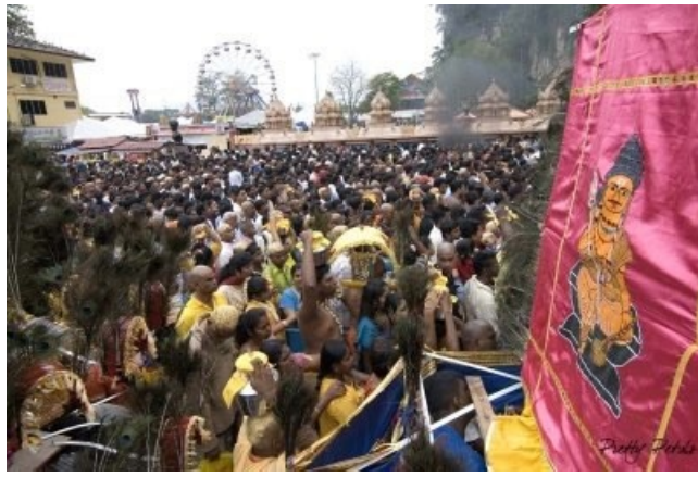
A bloody Ferris wheel even appeared during a Hindu Festival in Kuala Lumpur Wake Up!

Obviously it could all be a coincidence but the coincidences are growing all the time and I assure you more 'coincidences are planned as we speak'. Also let me point out that the Paris Ferris wheel is obviously taken from the Champs Elysees 'energy line' and placed on other energy lines time and time again. Is it possible that spiritual energy can be collected and released by the portable Ferris wheel when it is placed in other symbolic areas? Just a thought. The Paris Ferris wheel is made stable using water tanks. So it is literally always rising out of the water wherever it is placed. It has appeared in many places but always goes back to Paris. Here is a picture of it near a replica of an ancient Temple in Suan Lum Bangkok. Wakey Wakey!