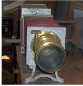
54. The stereopticon.

Armed with tacks, a hammer and a big armful of 8-inch by 10-inch advertising cards, he walked miles each day to tack up the cards where they would catch the eye of the public. He wrote his own newspaper reviews and took them to publishers, who were sometimes very prejudiced against the new Teachings, but his attractive personality often overcame their aversion and they would finally give him a whole page.