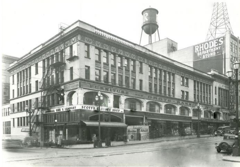
55. Arcade building, Seattle, 1932.