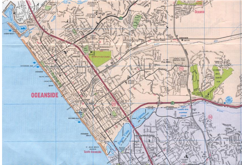
102. Map of Oceanside.

On the map of Oceanside, picture 95, you see a bold line near the top, running from left to right; that is highway 76. Mount Ecclesia is located north of that bend in Mission Avenue where the curve goes downward.