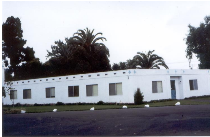
99. The New Administration Building, 1975.

"Every inch of the ground has been planned so that future development will be orderly and aesthetically pleasing. The plan will be implemented over the next ten to fifteen years.