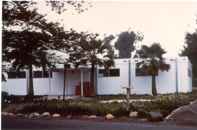
100. The Shipping Department, 1976.

“The city has requested that we install six inch water mains to provide better fire protection. This, of course, we are happy to do. A new main entrance has also been decided upon.