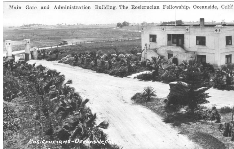
72. Main entrance with Administration Building.