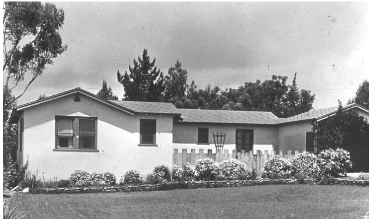
74. Heindel Cottage.

Nevertheless, the Fourth of July of 1915 was a day of rejoicing. The last one thousand dollars of the mortgage was paid. At the burning of the mortgage Max Heindel gave an address, Our Association: Its Progress and Prosperity .