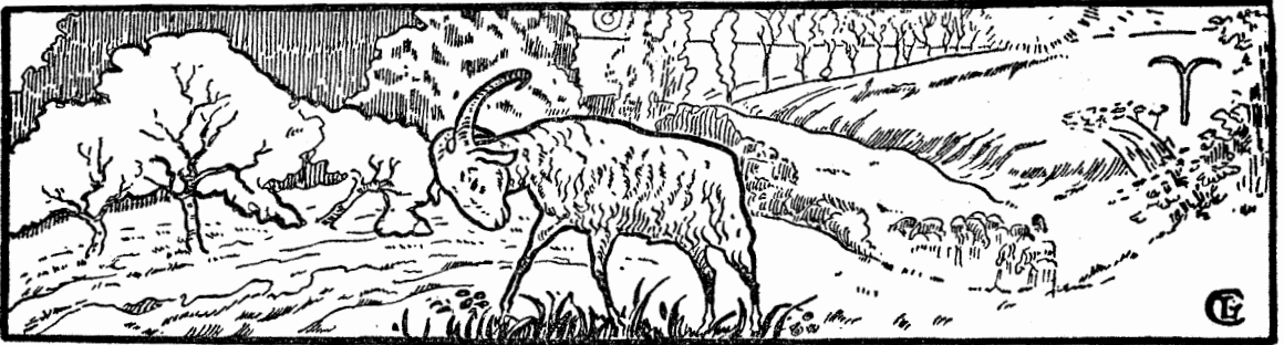
A Character Delineation of the Children Born between March 21st and April 20, inclusive, 1930.

The children of Aries are wiry, swift-moving, and of an impulsive, enthusiastic, and often quick-tempered disposition. The typical Arian child must be heard. He refuses to take a back seat. He must be noticed or you will hear from him, for he is not backward. If he can not lead he may refuse to play, and he is ever ready for an argument. He feels he must accomplish what he undertakes in a very short time, and if the work drags or is held back, he will lose patience and often throw it up, leaving the Taurian to come along and finish the job. On account of the Arian's rebellion against being led he does not make a very faithful employee; he ever rebels against leadership. While he is quick-tempered he is very quick to forgive.