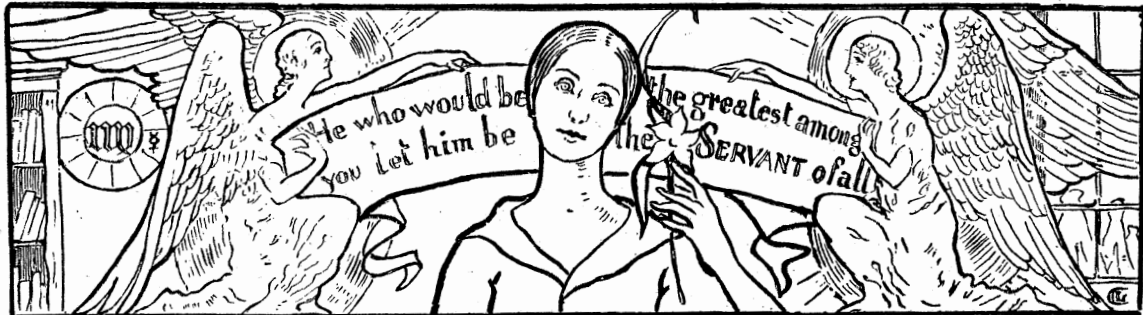
A Character Delineation of the Children Born between August 23rd and September 22nd, inclusive, 1928.

The children of Virgo are usually of a timid and retiring nature, and their feelings are very easily hurt. Their ambitions are high, but they very seldom attain to the heights of their ambition on account of their tendency to take offense very easily when their feelings are injured by those with whom they are associated. They just cannot put their feelings in their pocket and forgive and forget. This is apt at times to spoil what high ideals they may have had in association with their friends or relatives.