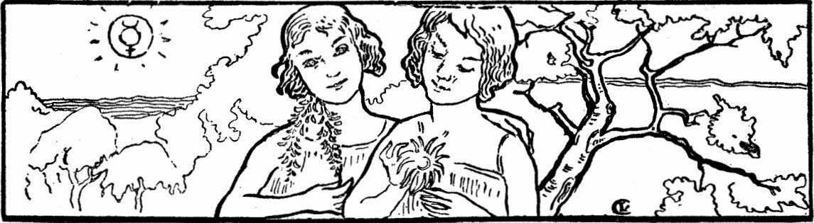
A Character Delineation of the Children Born between May 21st and June 21st, inclusive, 1928.

Mercury, the planet which has rule over the mind of man, is ruler of the sign of Gemini, and Gemini people as a result are intellectually inclined. Gemini is the head of the triangle of the airy triplicity, and is therefore considered intellectually the strongest of the group. Gemini being a double-bodied sign, the minds of Gemini people are usually flexible, ready to respond to persuasion and the opinions of others. When there are planetary afflictions in the horoscope, these people, being of a negative nature, respond very quickly and may become double-faced, or underhanded. When the planets are in their favor, they can be the most lovable and kindly of companions. They are fond of literature and science, but unless they are properly guided when young they are liable to dissipate their mental strength by taking up this thing today and another thing tomorrow, thereby becoming superficial. When young they should be guided so that their mental abilities are directed into one channel, developing one-pointedness.