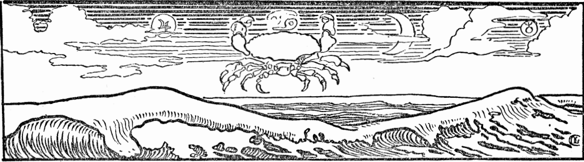
A Character Delineation of the Children Born between June 22nd and July 22nd, 1925, inclusive.

The children of Cancer are usually of a frugal, mysterious, but home-loving nature, extremely sensitive, mistrustful, and exacting, very much like the crab, which is the symbol of this sign. If you touch or frighten a crab, it crawls into its shell, and so it is with the Cancer child. It needs constant encouragement to keep it from thinking that it is not getting its share of appreciation.