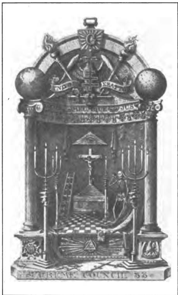
PLATE OF SUPREME COUNCIL Designed by W. P. Barrett