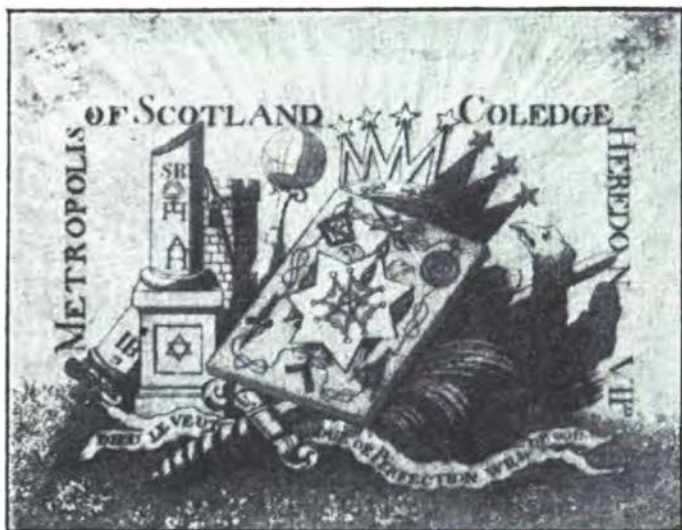
PLATE OF LODGE OF PERFECTION OF SCOTLAND