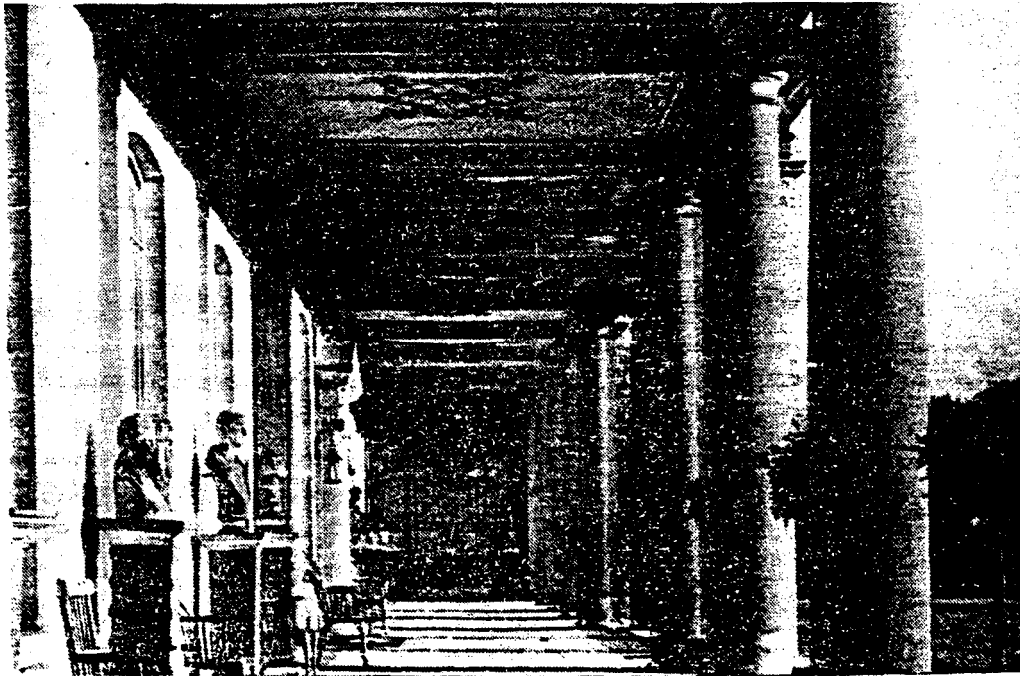
Porch of the House of "Hell Fire Francis".