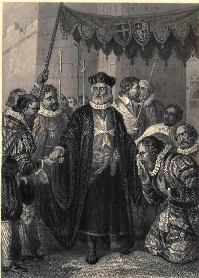
from an original Painting in the Palace at Malta.