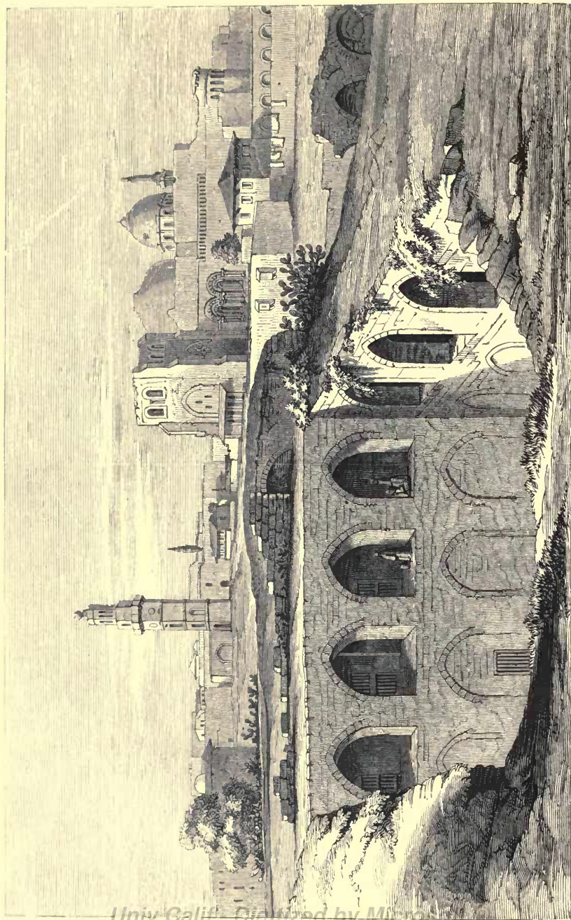
View of Ruins of the Hospital of the Knights of St. John, at Jerusalem.