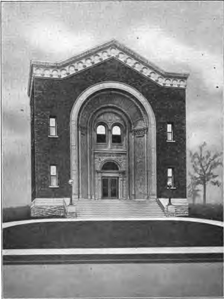
Temple of Hanselmann Lodge, Cincinnati, Ohio.