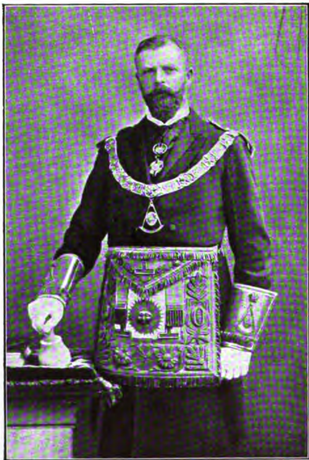
The Most Worshipful Pro. Grand Master, THE RT. HON. LORD AMPHILL, G.C.S.I. G.C.I.E. G.B.E., Etc. Etc.