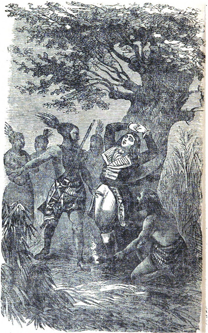
THE INDIAN MASON.