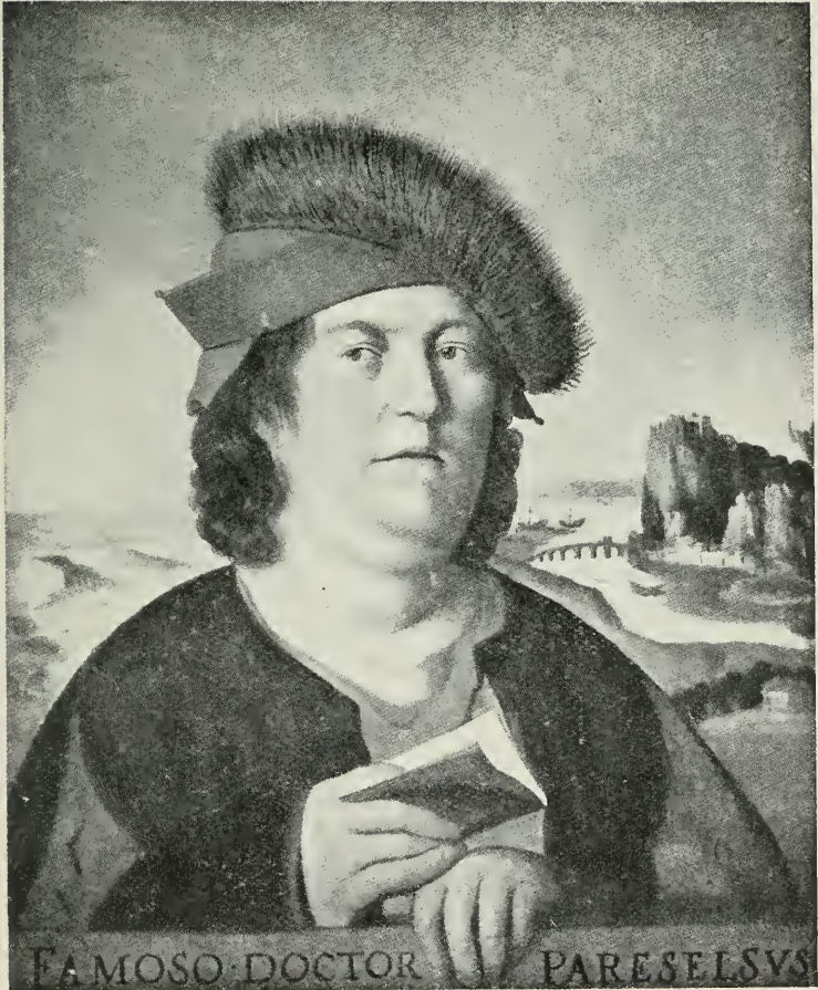
PARACELSUS (aged 24)

From a painting by Scorel (1517), now in the Louvre Gallery.