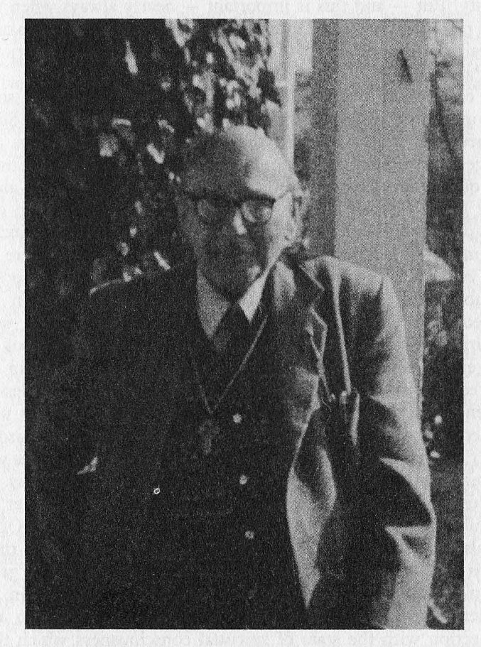
At 'Old Domons' in Devon on a lecture weekend

These are really fundamental questions, and they open up extensive vistas of thought. So much so that we can only indicate some of these in more or less general terms. There are two aspects of esoteric work, one concerned with the training and