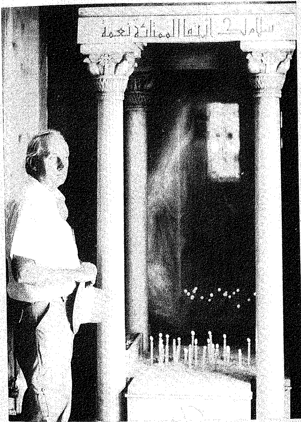
APPARITION OF THE VIRGIN MARY Photographed in the Coptic Cathedral of the Virgin Mary, Cairo, Egypt November 1989