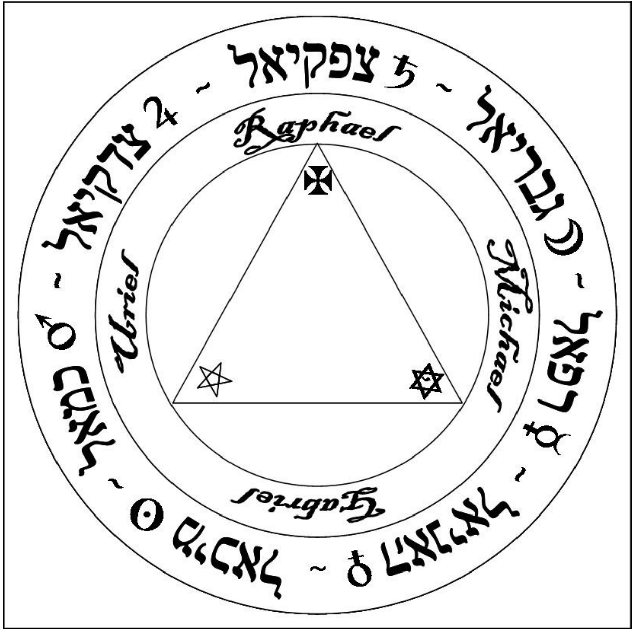
Figure 1 Table of Practice