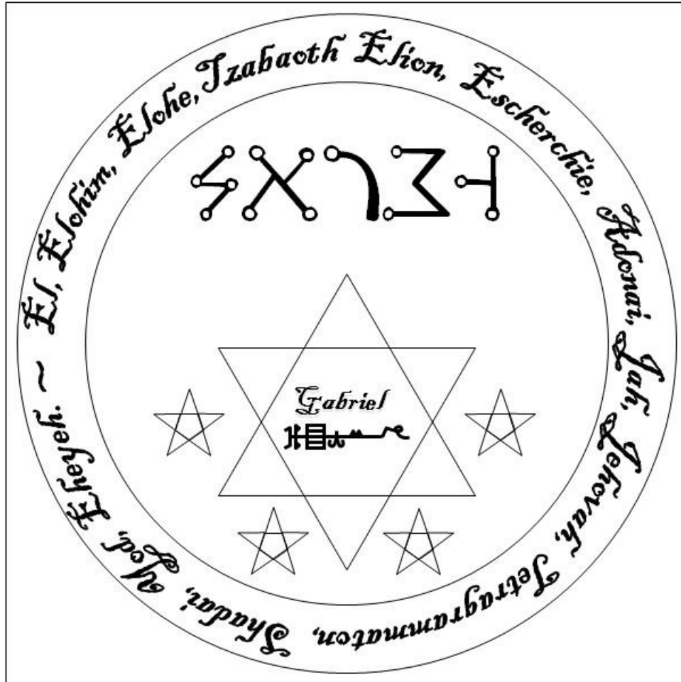
Figure 2. The Lamen of Gabriel

indigo would be best, but use what you have.