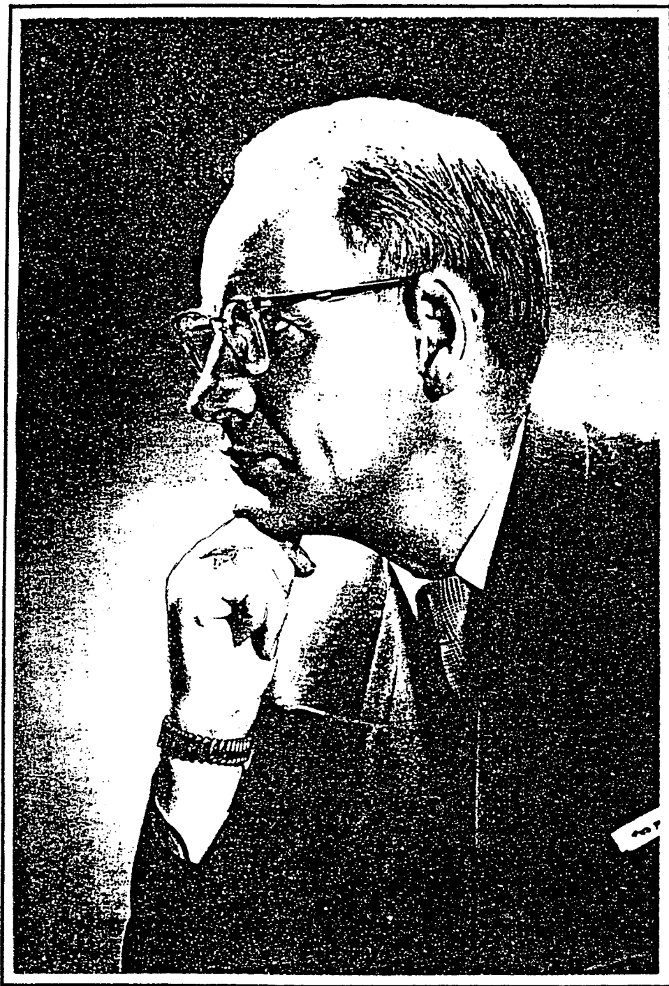
Photograph of the author - Richard, Duc de Palatine