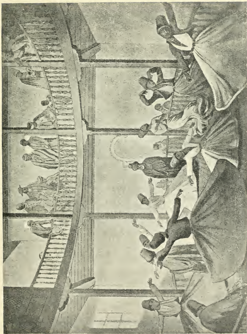
THE DEVR OF THE MEVLEVI ORDER