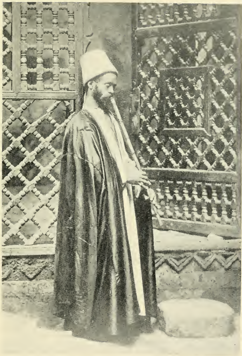
A MEVLEVI PLAYER ON THE NEY, OR REED-FLUTE