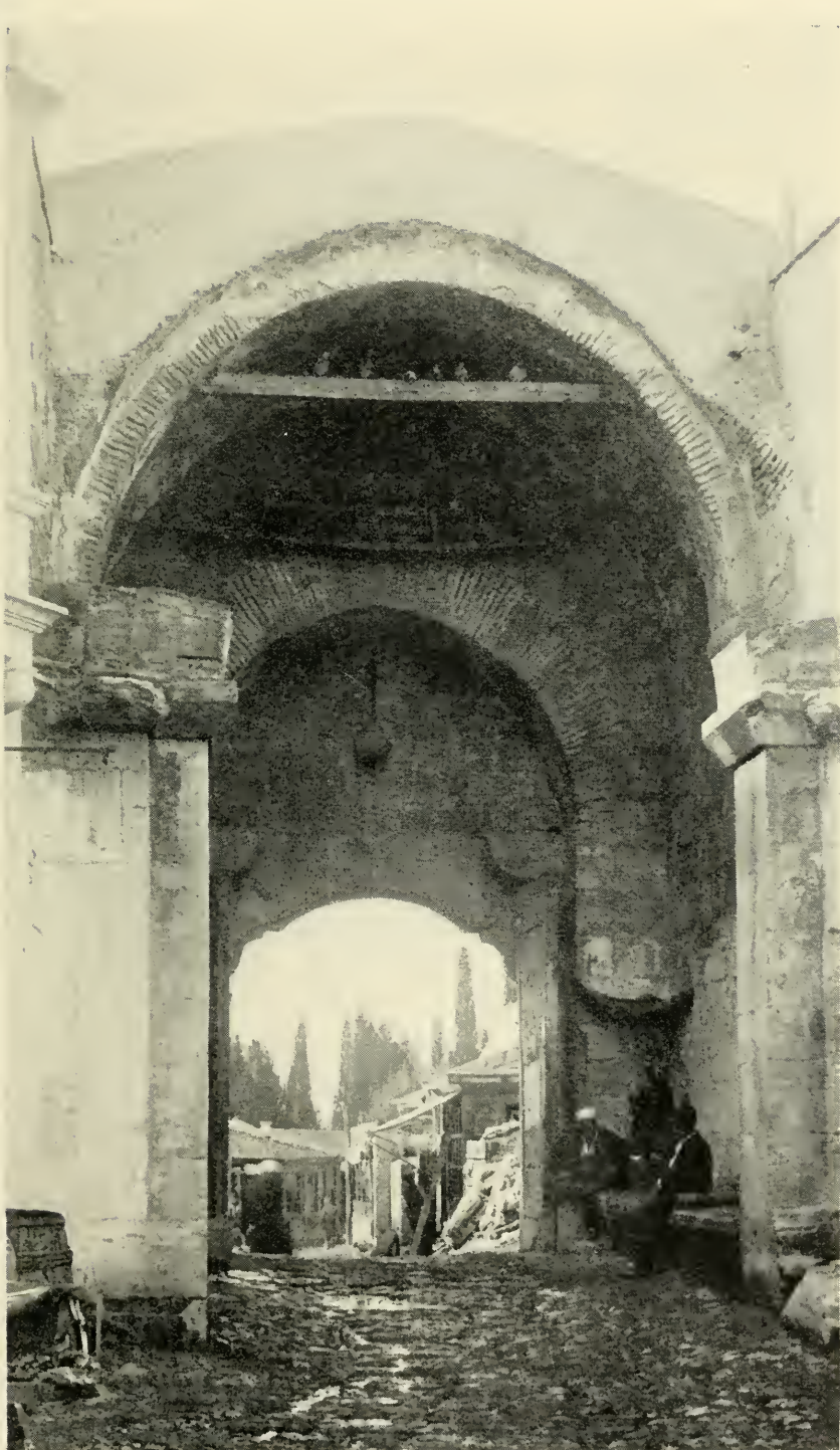
THE ADRIANOPLE GATE, STAMBOUL, LEADING TO THE DERVISH CEMETERY