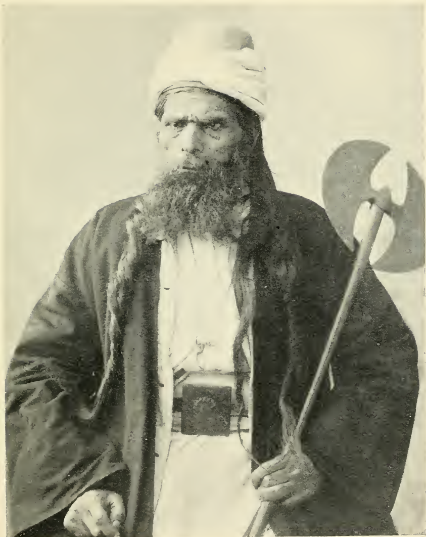
A RŪFAI, OR "HOWLING" DERVISH