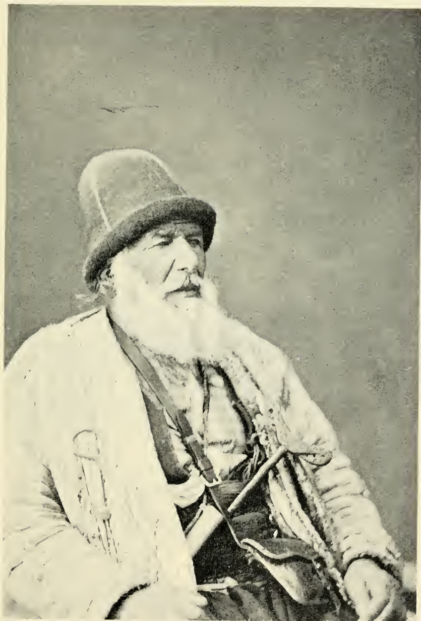
DERVISH WITH LEANING CRUTCH