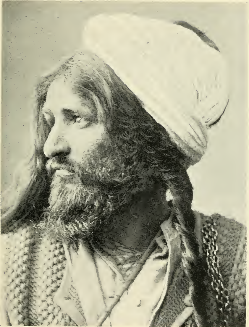
A WANDERING DERVISH