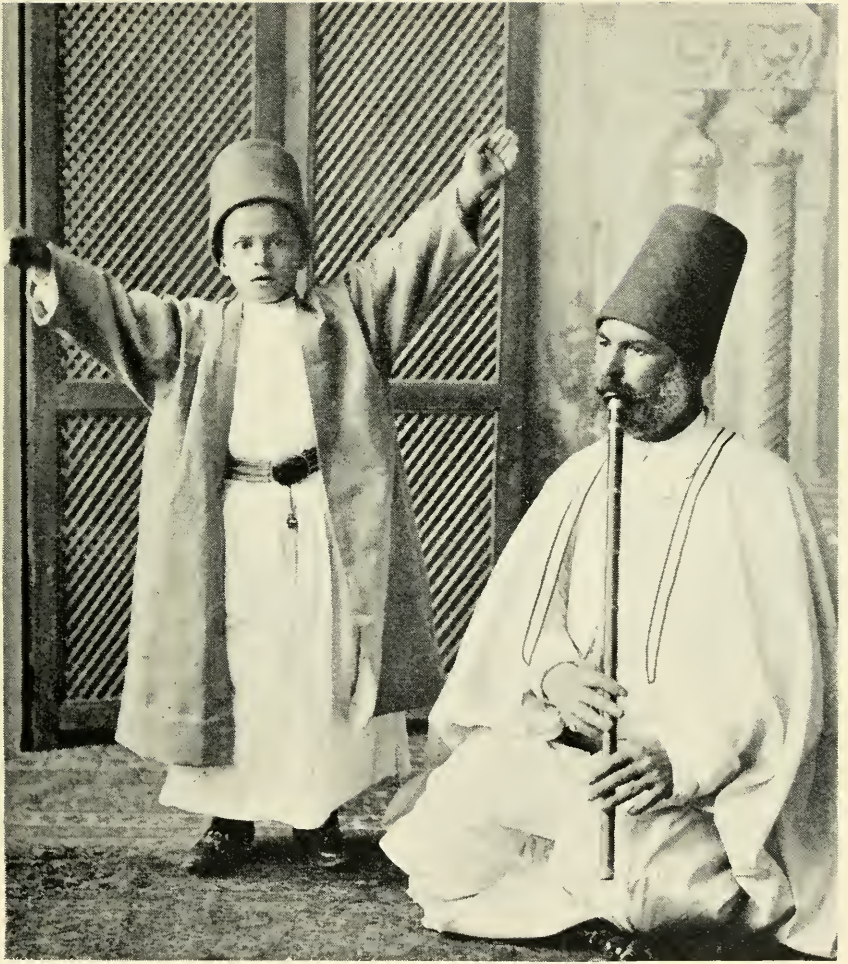
MEVLEVI NEOPHYTE LEARNING THE DEVR