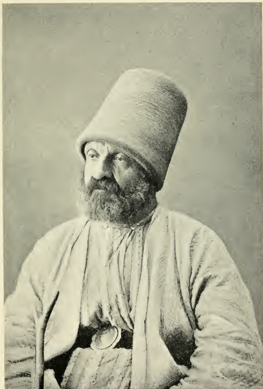
AN ELDER OF THE MEVLEVI ORDER