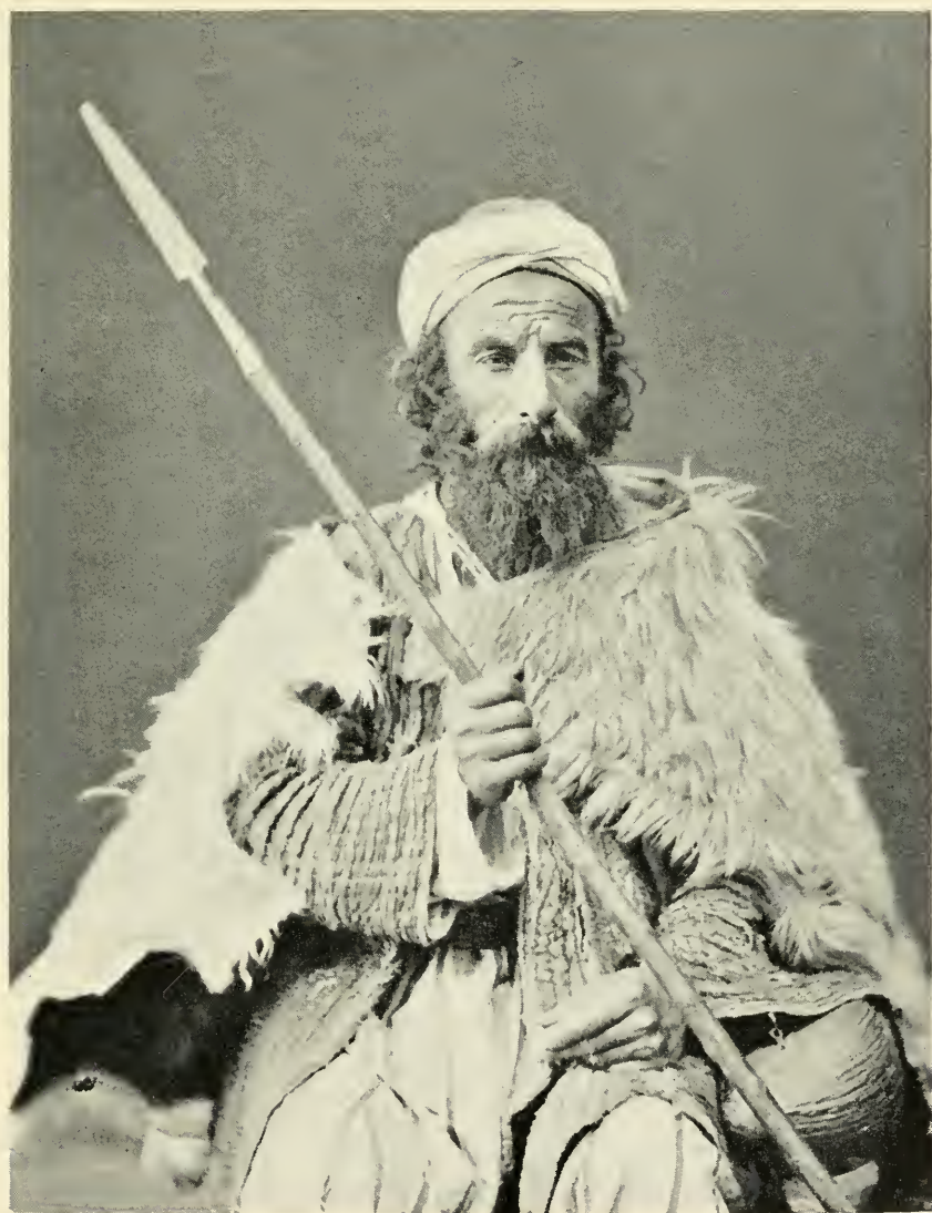
A WANDERING DERVISH