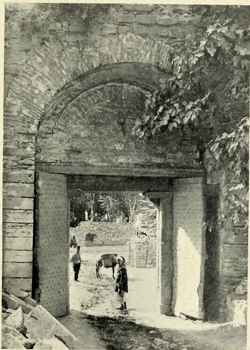
CITY GATE CALLED THE MEVLEVI-HANĒ, STAMBOUL