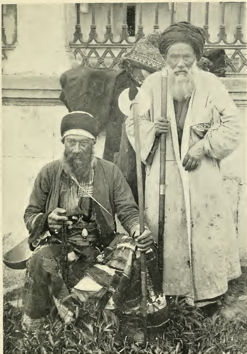
BEGGING DERVISH AND NIGHT-WATCHMAN