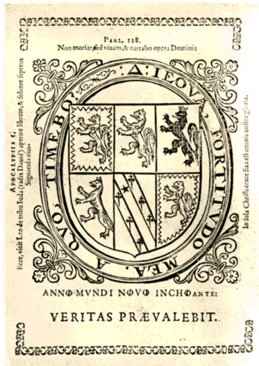
ARMS OF DEE AS SHOWN IN A CUT AT THE END OF HIS "LETTER APOLOGETICALL" (1599).

From an illustration to his Letter and Apology, presented to the Archbishop of Canterbury 1599, second edition 1603