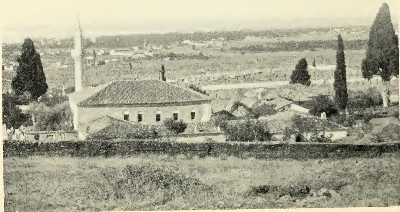
A MEVLEVI TEKKEH, SALONICA