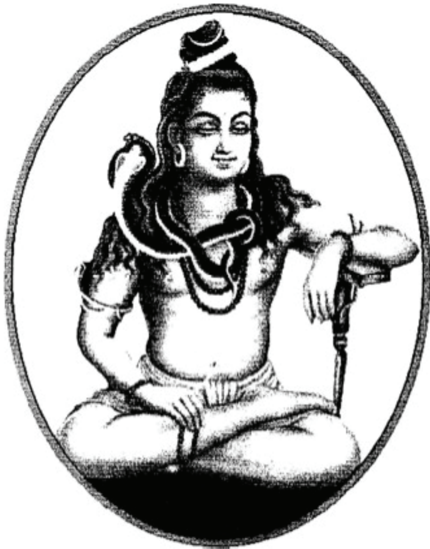
LORD SHIVA – Master of the Yogis