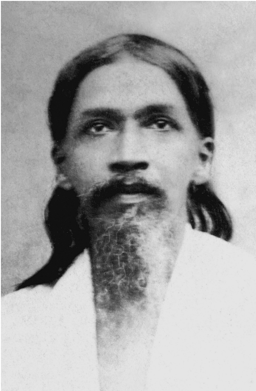
Sri Aurobindo in Pondicherry, c. 1915-1918