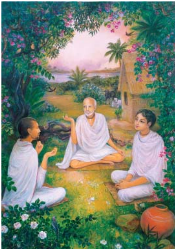
Śrīla Raghunatha Dāsa Babajī explains Daśa-mūla to Vrajanatha and Vijaya Kumara in Navadvīpa.