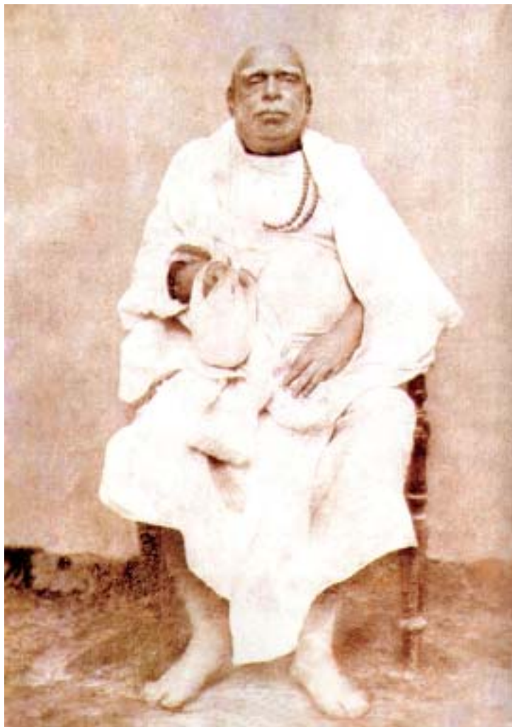
Om Viṣṇupāda Saccidānanda Śrī Śrīmad Bhaktivinoda Ṭhākura