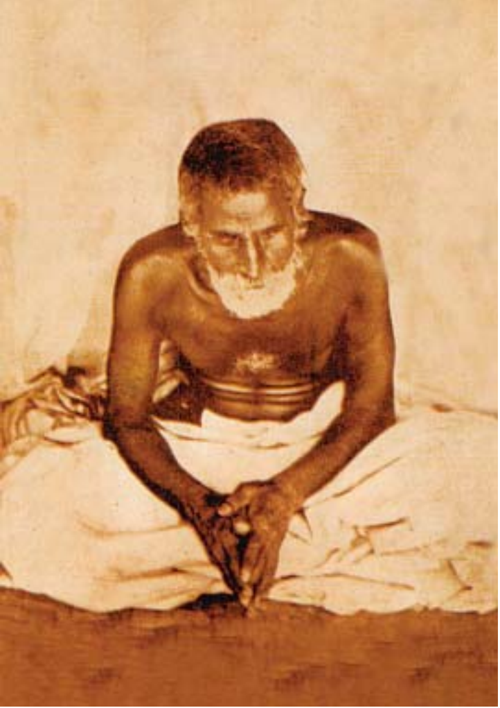
Om Viṣṇupāda Paramahaṁsa Śrī Śrīmad Gaurakīśora Dāsa Babajī Mahārāja