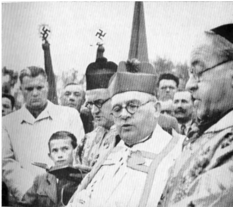
Roman Catholic clergy blessing Nazi emblems