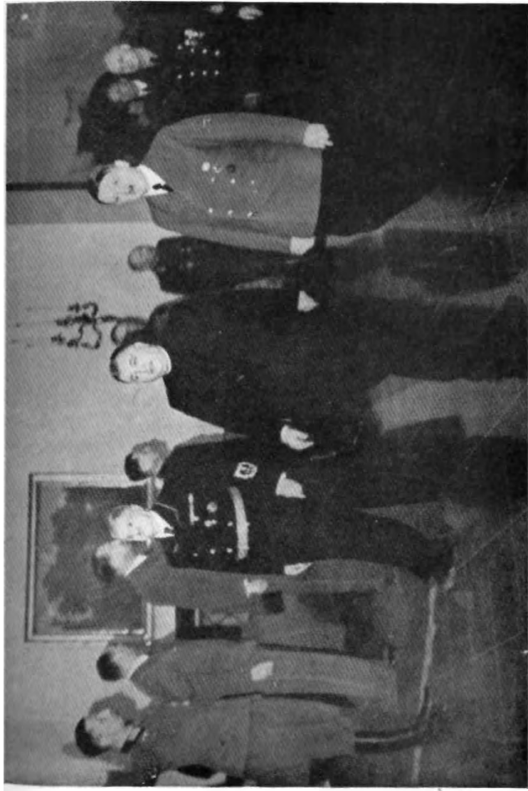
Mgr. Tiso, Head of the Slovak State, as Hitler's guest