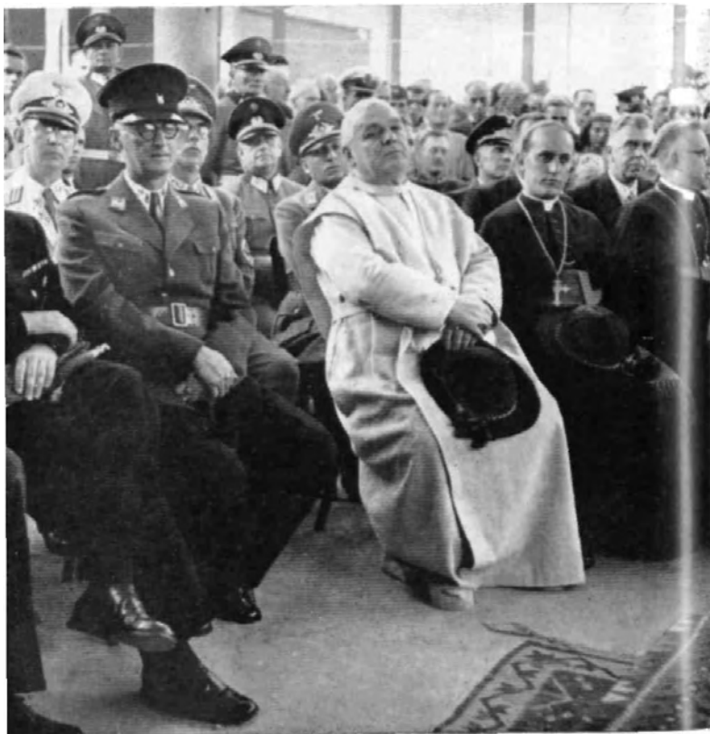
Archbishop Stepinac and the pontifical legate Marcone attending a military parade in Zagreb, surrounded by Italian, German and Ustashi Officers