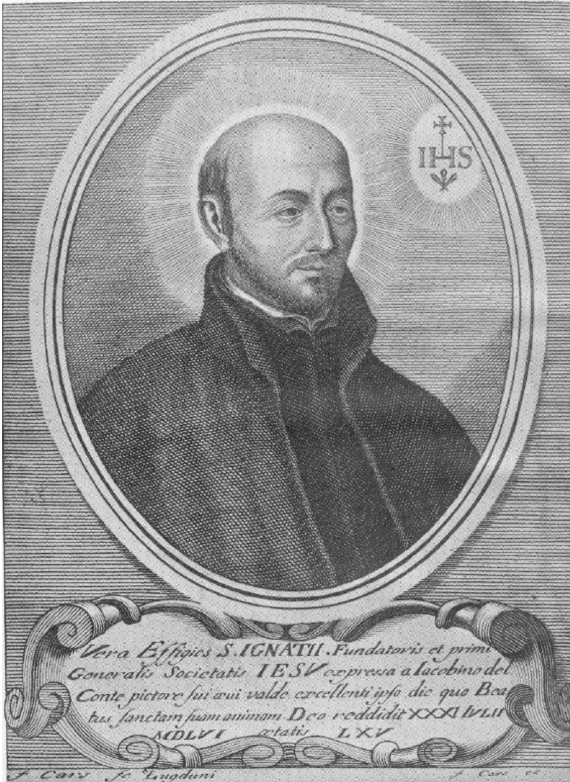
IGNATIUS LOYOLA, Founder of the Jesuits.