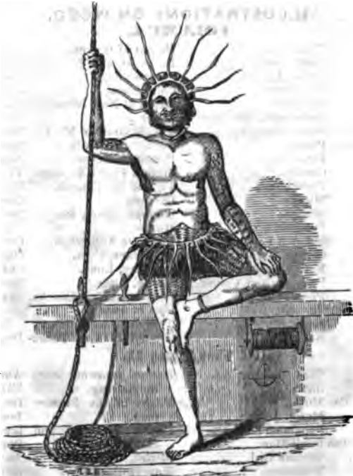
(NATIVE OF ELLICE'S ISLANDS.)

Arms, Implements and Utensils; Portraits, Landscapes and Scenery; Remote and hitherto Undiscovered Localities;