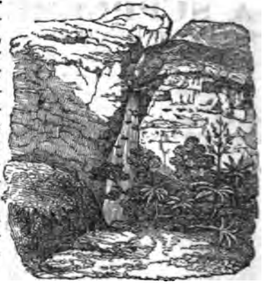
Cascade of Niagara.

and represent- ing every vari- ety of object, curious either in Nature or Art. Remark- able Build- ings; Views of Cities; Places Cele- brated in His- tory, or inter- esting from Natural Phen- omena; the Appearance